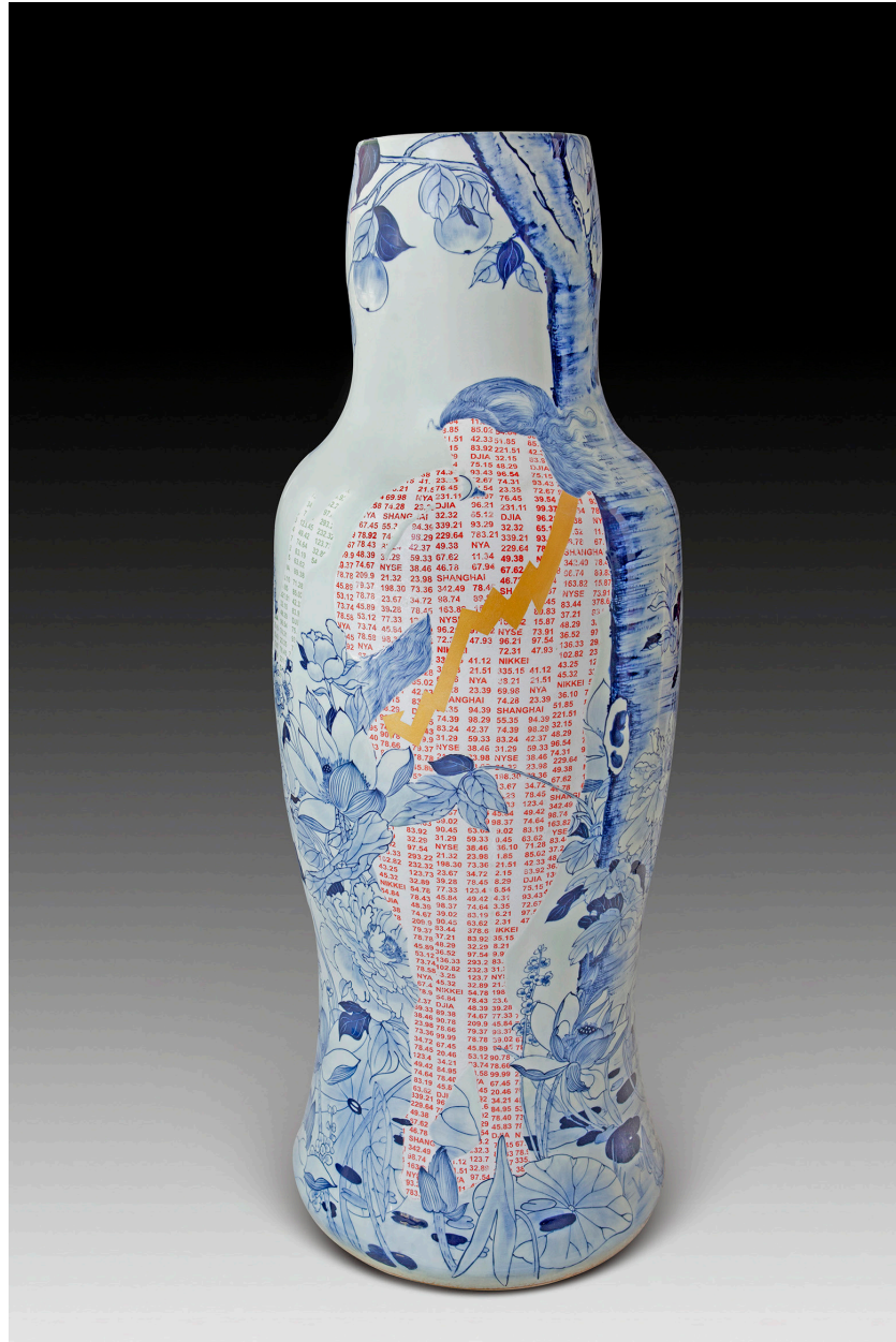
Sin-ying Ho, A Hope no. 1 , 2014; porcelain, hand-painted cobalt pigment, transfer d, 41 x 18 x 18 in (104 x 45.7 x 45.7 cm)