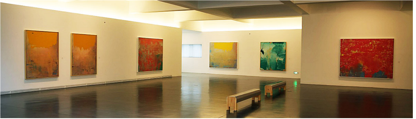
Lianghong Feng, Abstract Paintings by Lianghong Feng, Inside Out - Museum Art Museum, Beijing, 2013