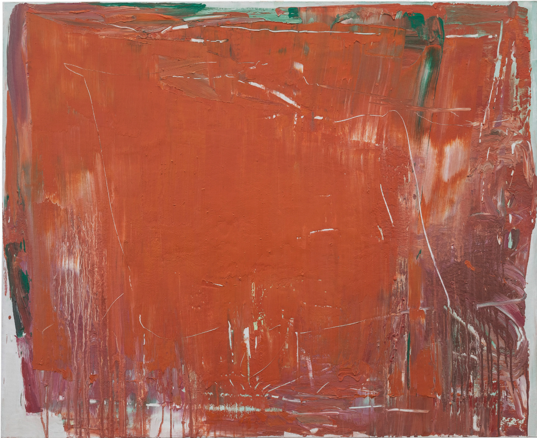
Lianghong Feng, Composition Red 14-21, 2014, oil on canvas, 59 x 48 in (150 x 122 cm)