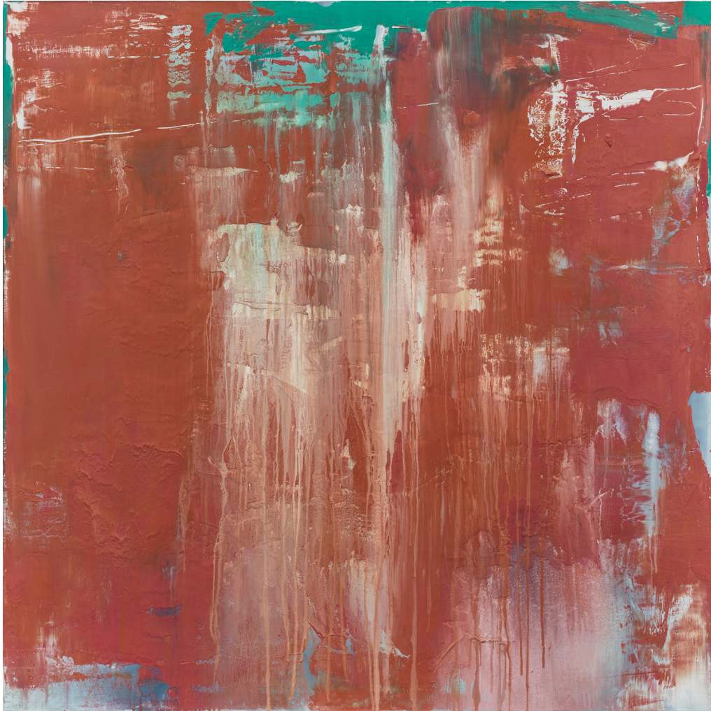
Lianghong Feng, Composition Red 14-20, 2014, oil on canvas, 59 x 59 in (150 x 150 cm)