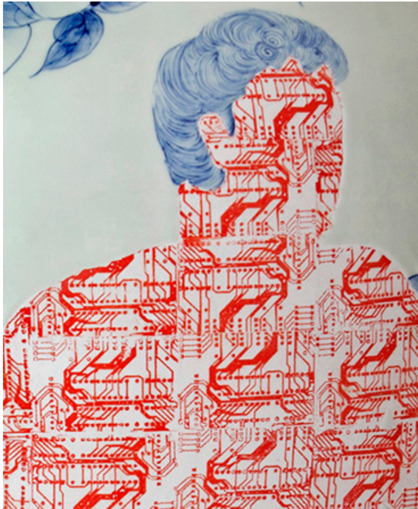
Sin-ying Ho, A Hope no. 1, 2014; porcelain, hand-painted cobalt pigment, transfer d, 41 x 18 x 18 in (104 x 45.7 x 45.7 cm), detail