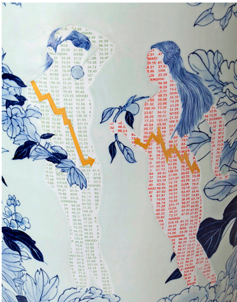
Sin-ying Ho, A Hope no. 1 , 2014; porcelain, hand-painted cobalt pigment, transfer d, 41 x 18 x 18 in (104 x 45.7 x 45.7 cm), detail