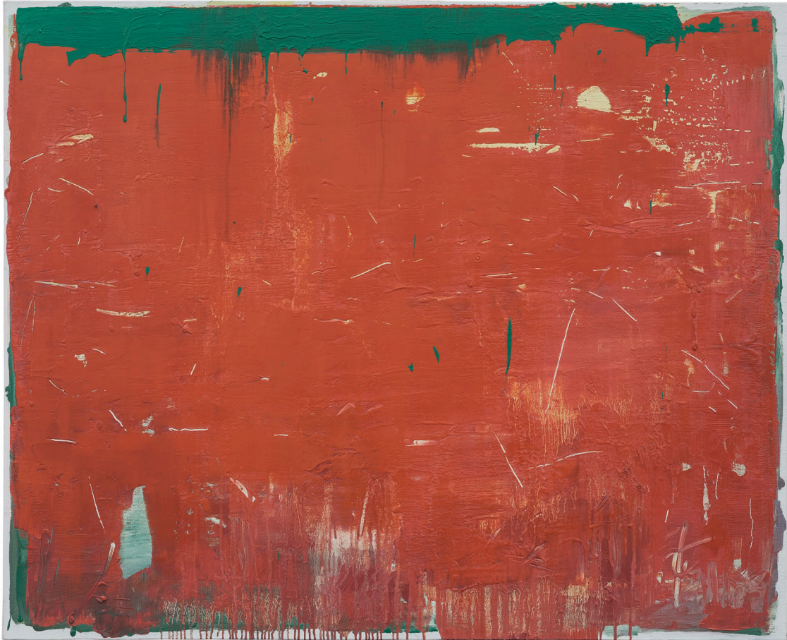
Lianghong Feng, Composition Red 14-18, 2014, oil on canvas, 59 x 48 in (150 x 122 cm)