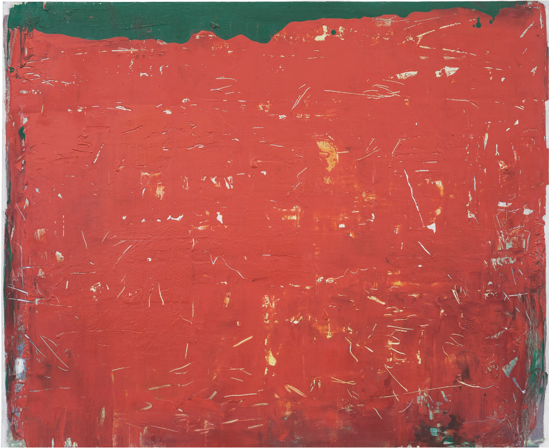
Lianghong Feng, Composition Red 14-17, 2014, oil on canvas, 59 x 49 in (150 x 125 cm)