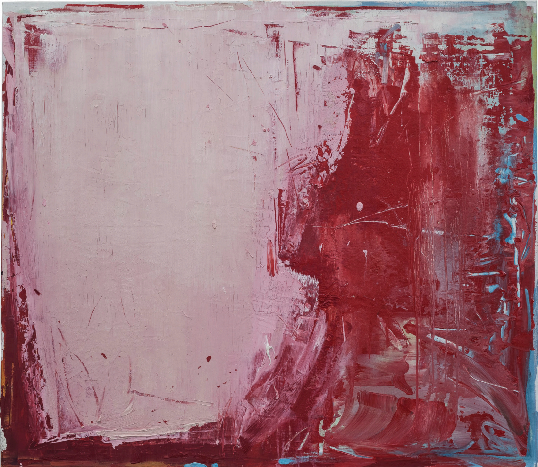
Lianghong Feng, Composition 14-18, 2014, oil on canvas, 59 x 51 in (150 x 130 cm)