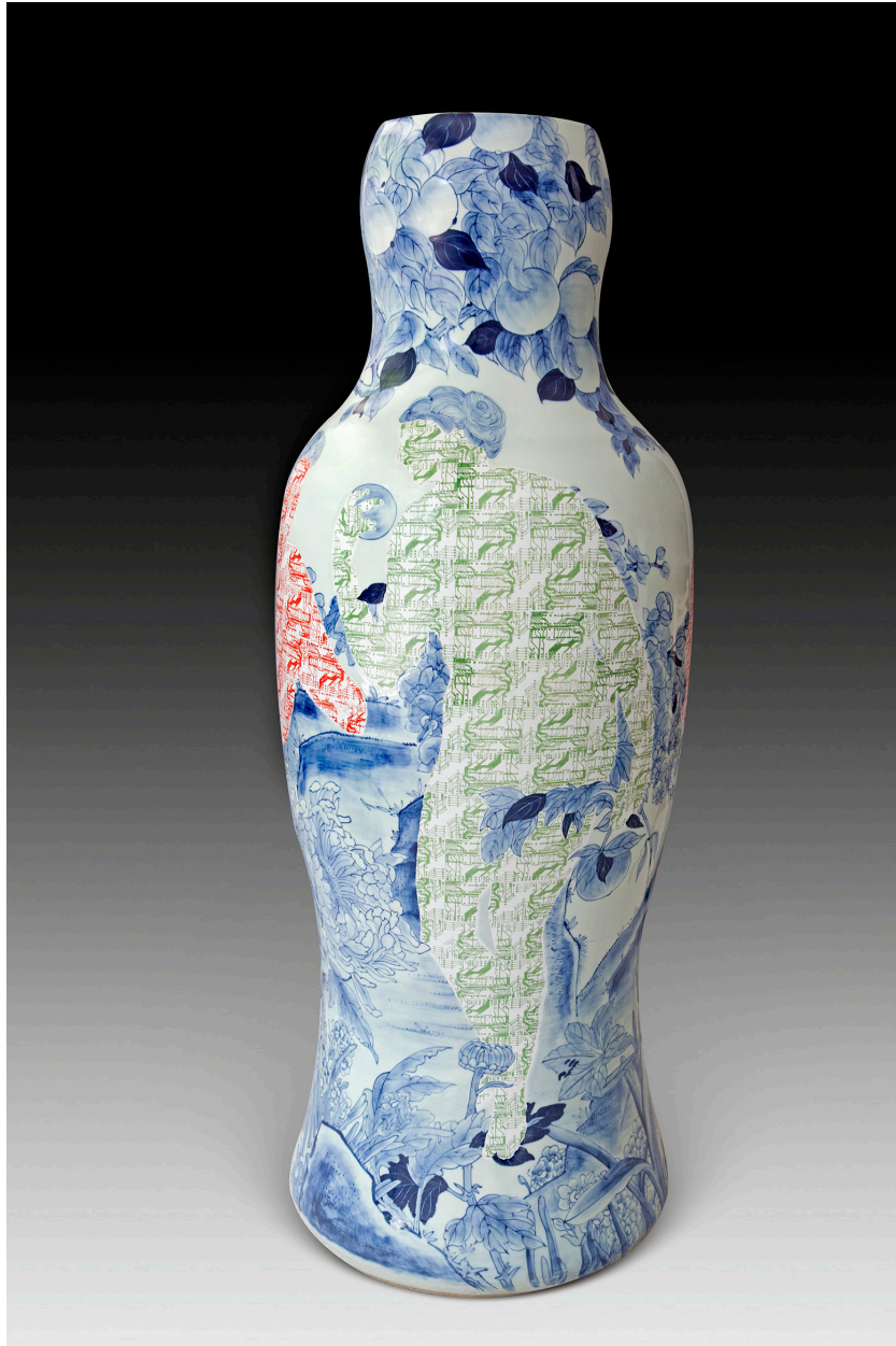
Sin-ying Ho, Transformation no. 1, 2014; porcelain, hand-painted cobalt pigment, transfer d, 41 x 18 x 18 in (104 x 45.7 x 45.7 cm)