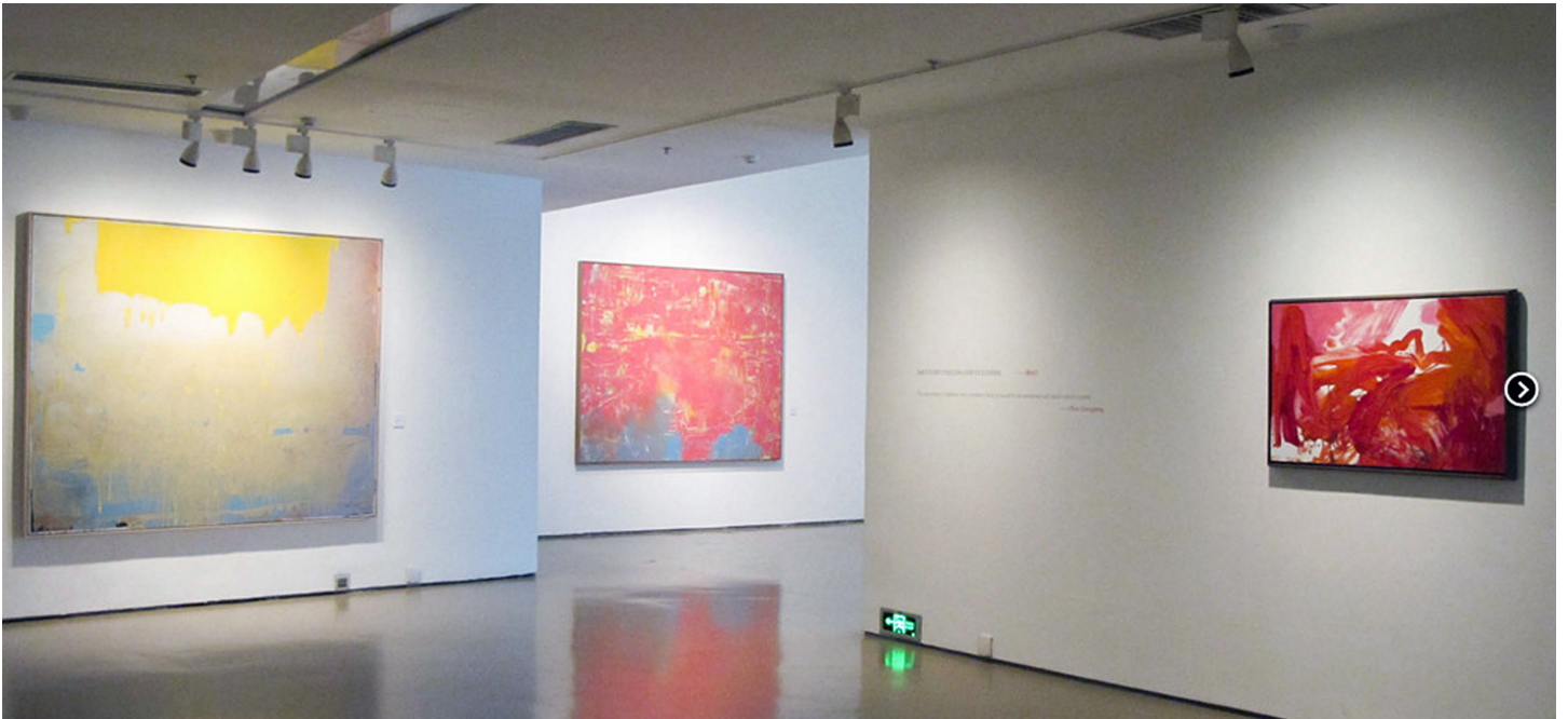
Lianghong Feng, The Research Exhibition of Abstract Art in China, Today Art Museum, Beijing, January - March 2016