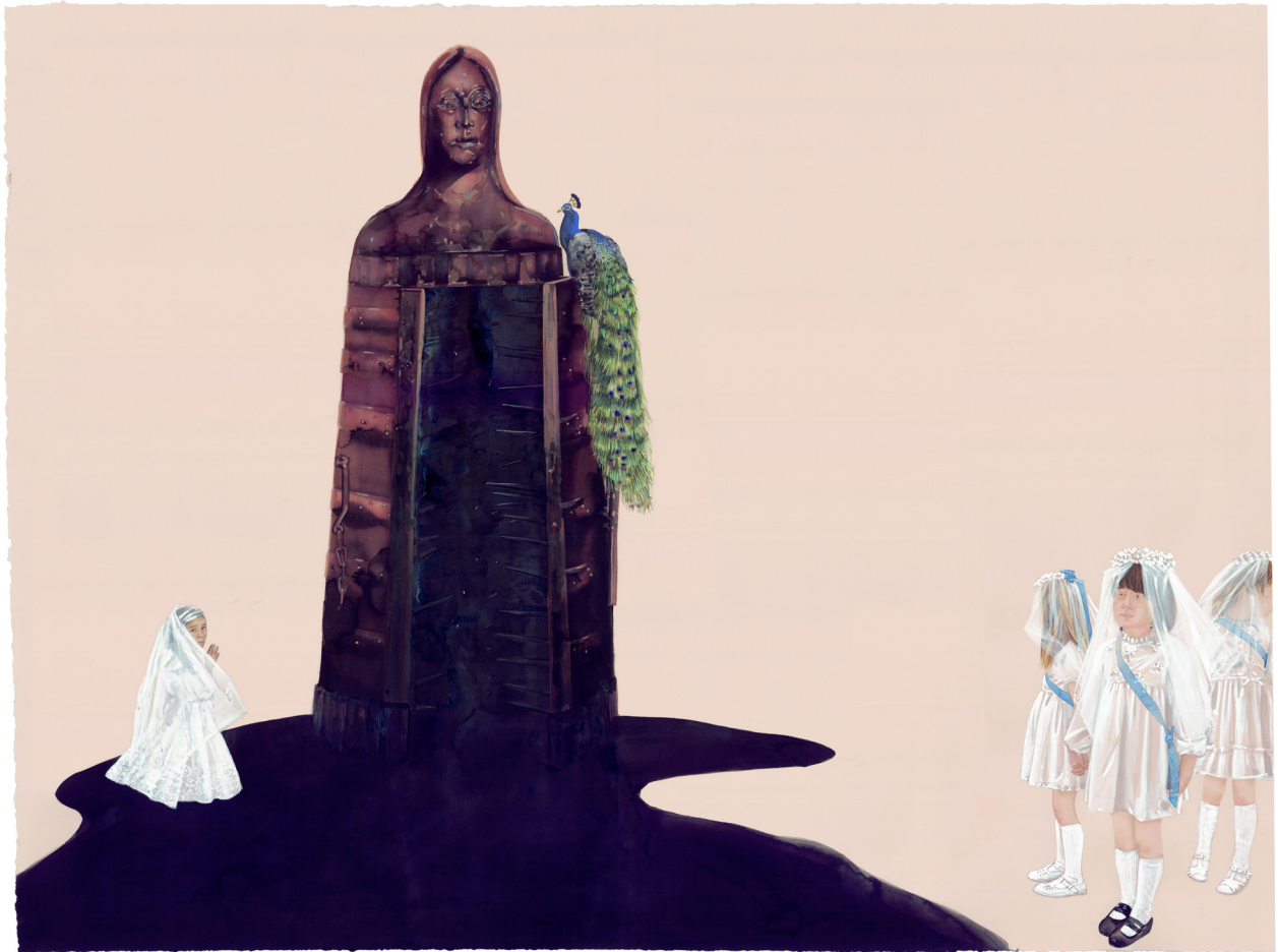
Dawn Black, Iron Maidens, 2012; ink, gouache, watercolor on paper, 30 x 40 in (76.2 x 101.6 cm)