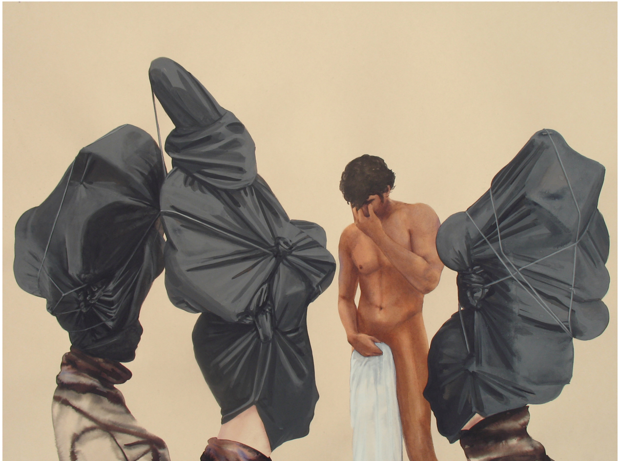
Dawn Black, Tribunal, 2009; ink, gouache, watercolor on paper, 22 x 28 in (55.9 x 71.1 cm)