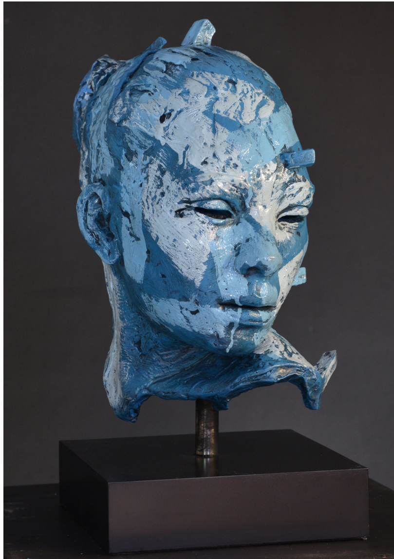
Lionel Smit, Divergent #2 Head, 2011, cast resin and auto paint, 21 ½ x 13 ½ in ( 54.6 x 34.3 cm)