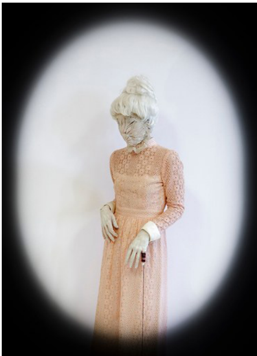
Danielle Julian Norton, Everything is Fine 13, 2013, pigment print and oval frame 1/5, 24 x 15 in (61 x 38.1 cm)