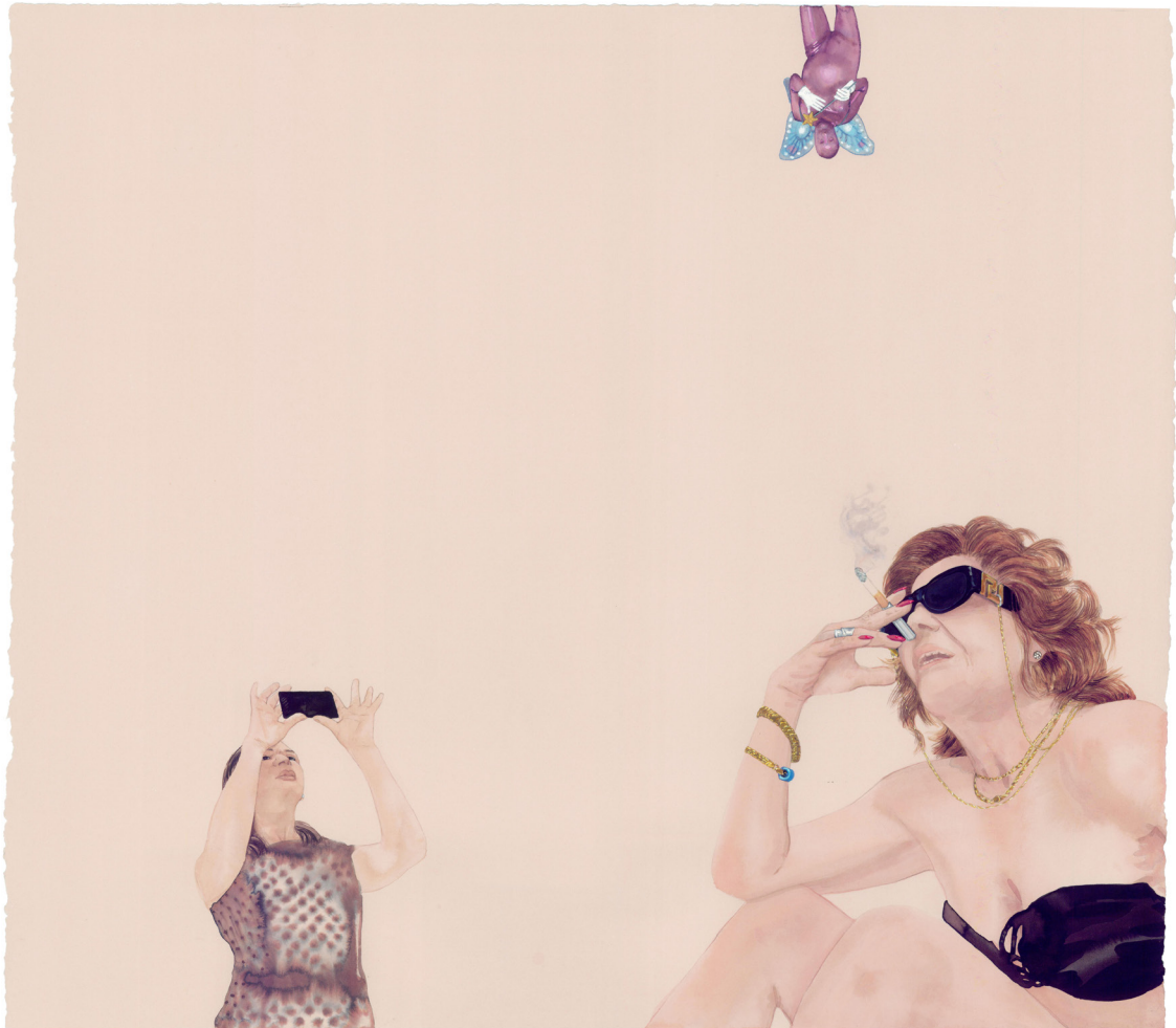
Dawn Black, Second Coming, 2012; ink, gouache and watercolor on paper, 20 x 22 ¾ in (50.8 x 57.8 cm)