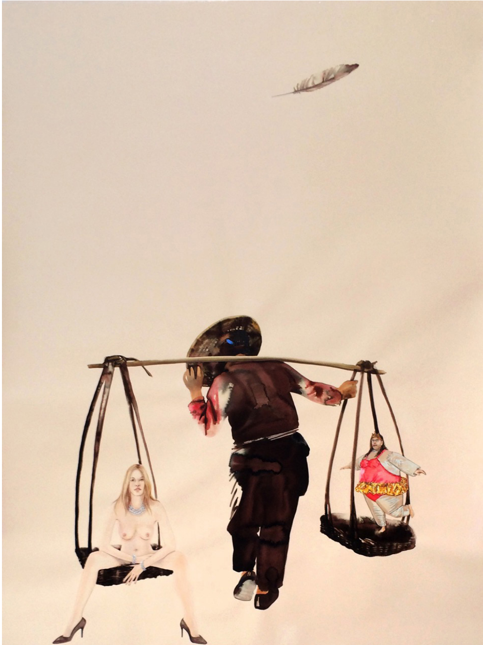
Dawn Black, Truth's Weight, 2015; ink, gouache, watercolor on paper, 46 x 35 in (116.8 x 88.9 cm)