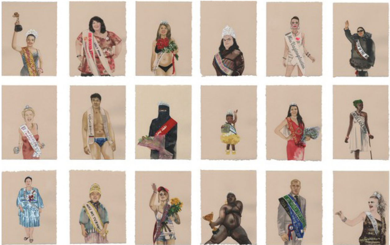
Dawn Black, Conceal Project: Aesthetics, 2014; ink, gouache, watercolor on paper, each 7 ½ x 5 ½ in (19 x 14 cm)