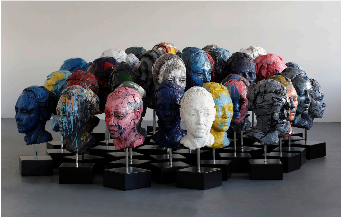
Lionel Smit, Accumulation of Disorder, 2012; resin hand finished with automotive paint, size variable