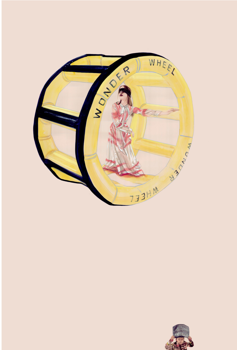
Dawn Black, Wonder Wheel, 2015; ink, gouache and watercolor on paper, 50 x 35 in (127 x 88.9 cm)