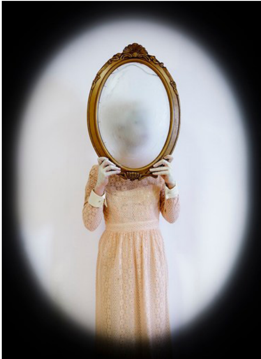
Danielle Julian Norton, Everything is Fine 12, 2013, pigment print and oval frame 1/5, 24 x 18 in (61 x 45.7 cm)