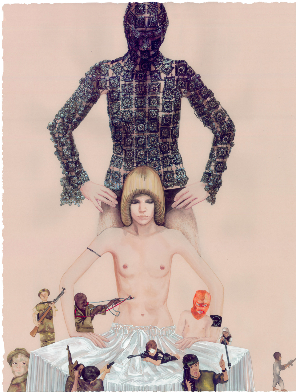
Dawn Black, Our Brood , 2011; ink, gouache, watercolor on paper, 28 ½ x 22 in (72.4 x 55.9 cm)