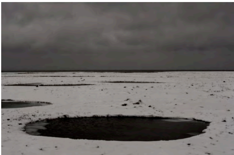
Jennifer Moller, 02_21_2013 9:04 am, detail