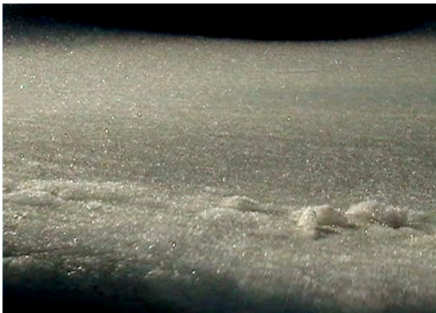
Jennifer Moller, seas , single-channel video projection/ video still, 2009, permanent collection of Hood Museum of Art at Dartmouth College, Hanover, NH

In POOLS: Mighty Plenitude , the gallery reintroduces "seas" in addition to Moller's latest stop-motion video, Tidal Immanence . Her work seas , which currently is in the permanent collection of the Hood Museum at Dartmouth University in Hanover, New Hampshire, has as its subject the slushy ice of the Atlantic Ocean on the Cape Code shoreline in winter. The waves, heavy with crystalline ice, are recorded in monochrome -- grainy black and white imagery that underscores the power and potency of the ocean's force.