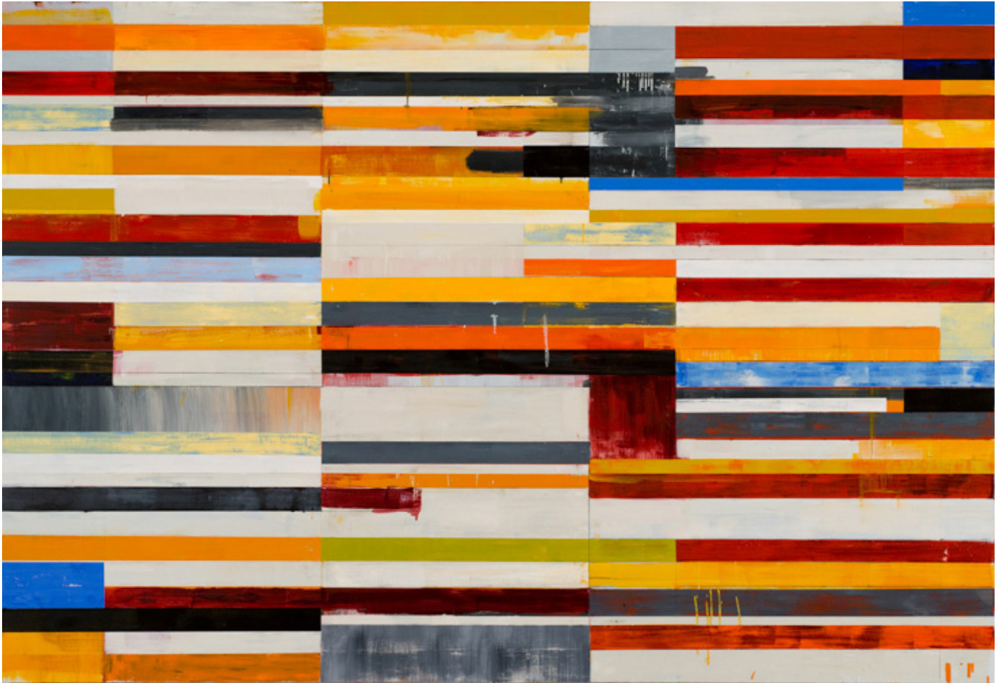
Lloyd Martin, Slat, 2013, oil on canvas, 66 x 96 in (167.64 x 243.84 cm)