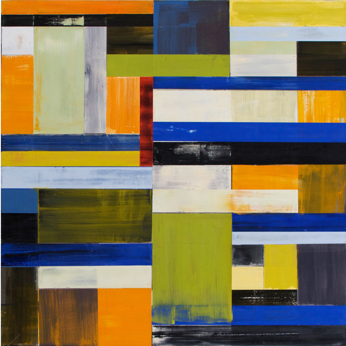
Lloyd Martin, Azure (small), 2015, oil on canvas, 36 x 36 in (91.44 x 91.44 cm)