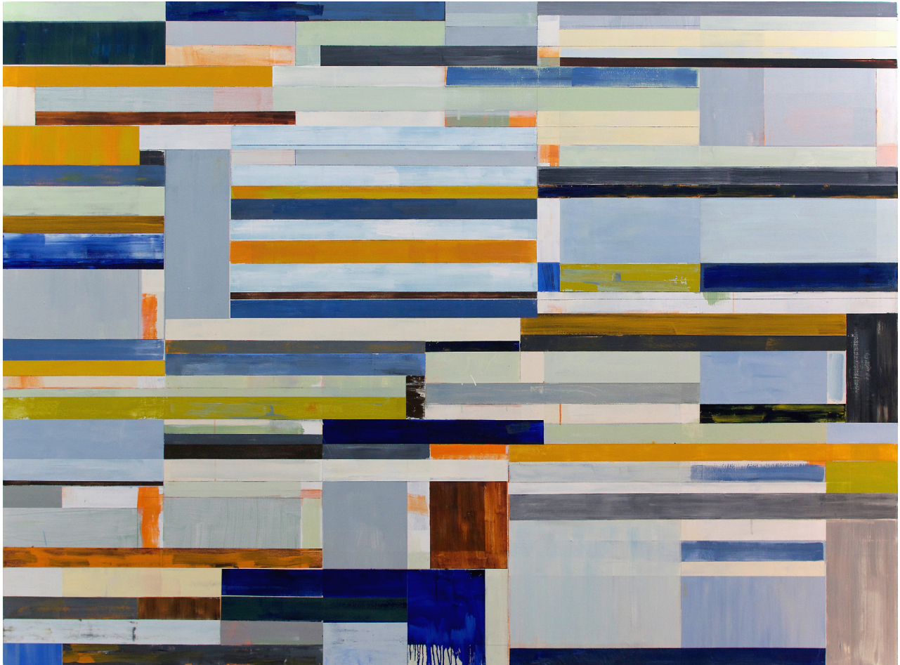
Lloyd Martin, Blue Scan, 2013, oil on canvas, 66 x 96 in 167.6 x 243.8 cm)