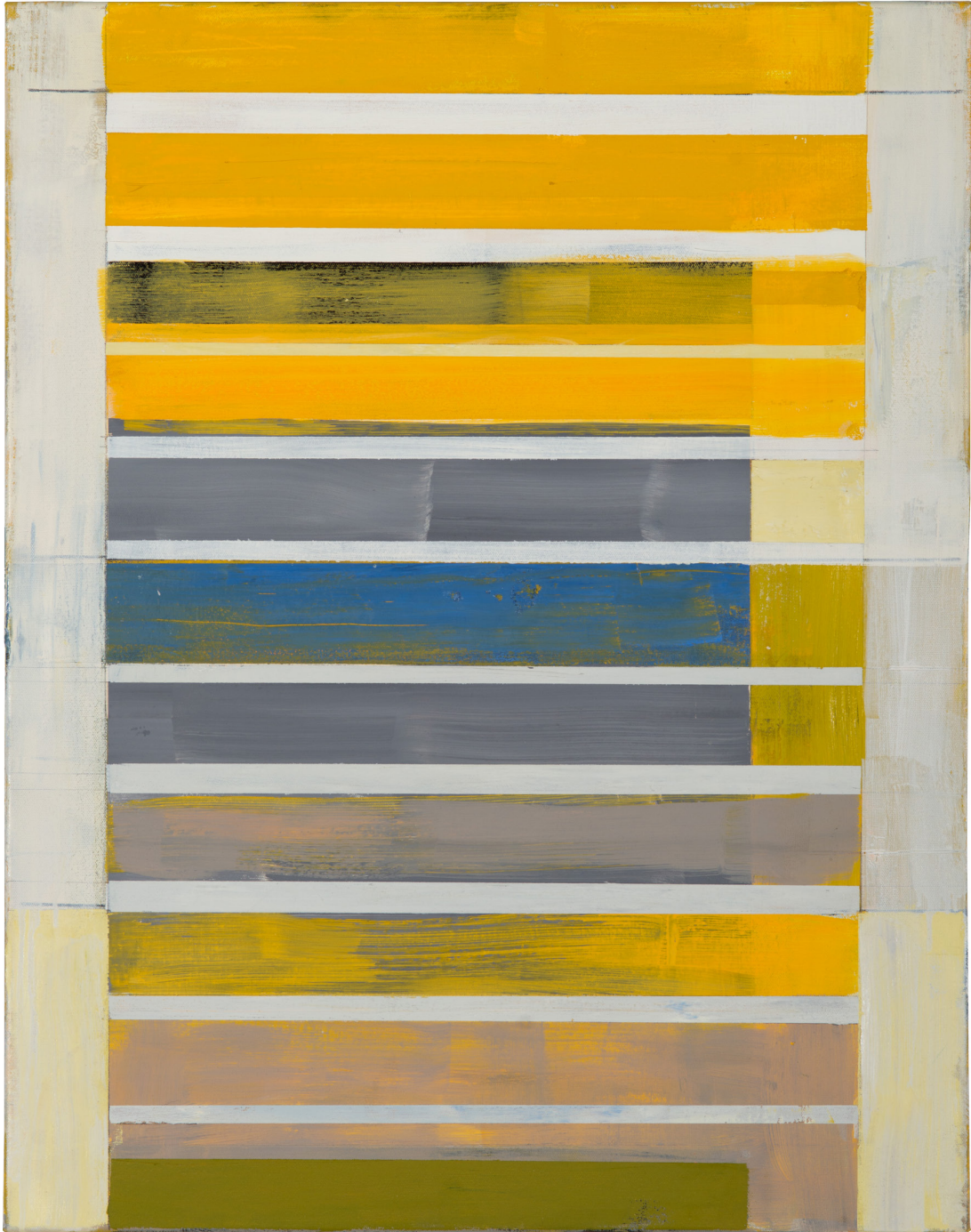
Lloyd Martin, Folio Series 8, 2013, oil on canvas, 28 x 22 in (71.12 x 55.88 cm)