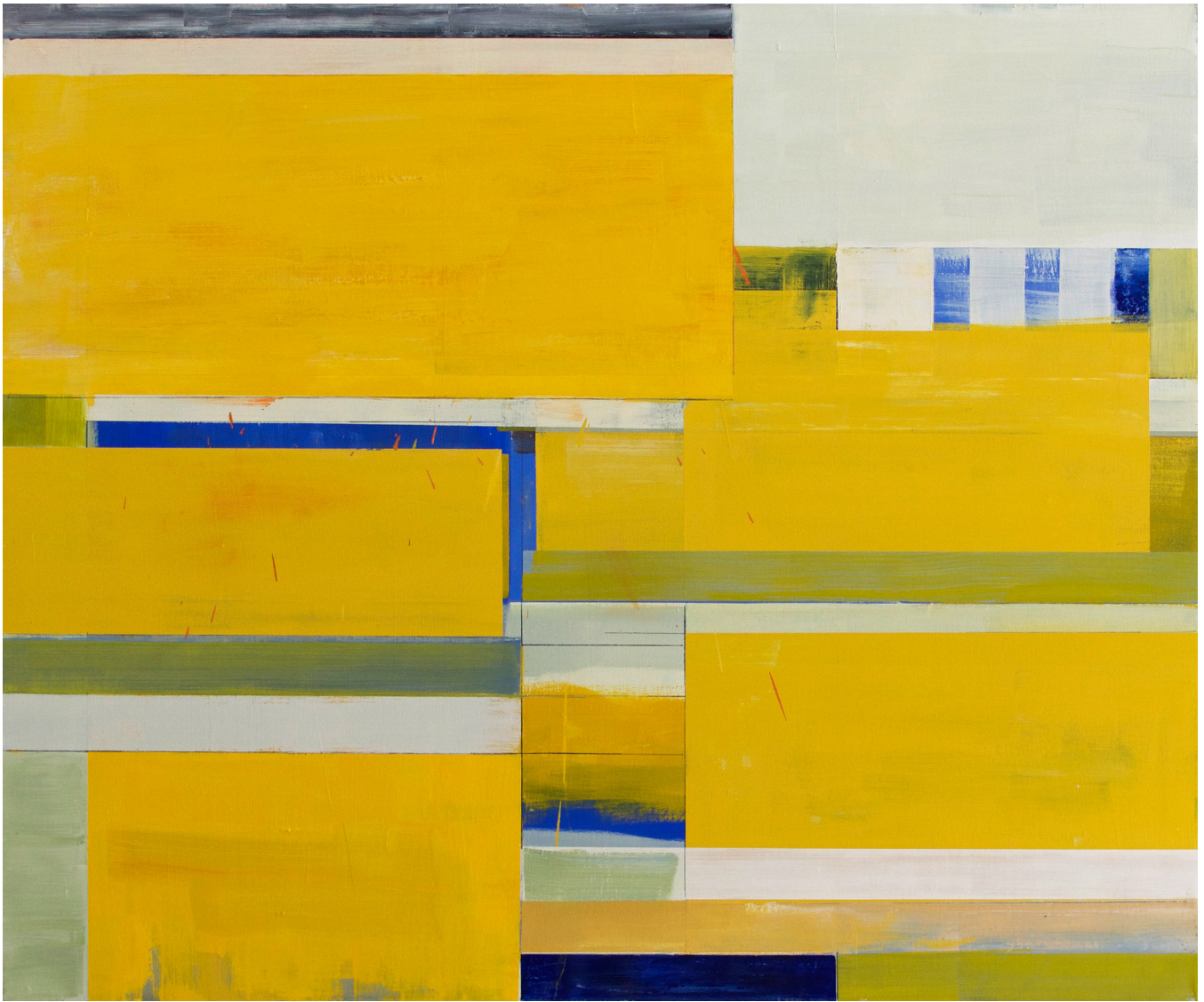
Lloyd Martin, Yellow Shim (small), 2015, oil on canvas, 40 x 48 in (101.6 x 121.92 cm)