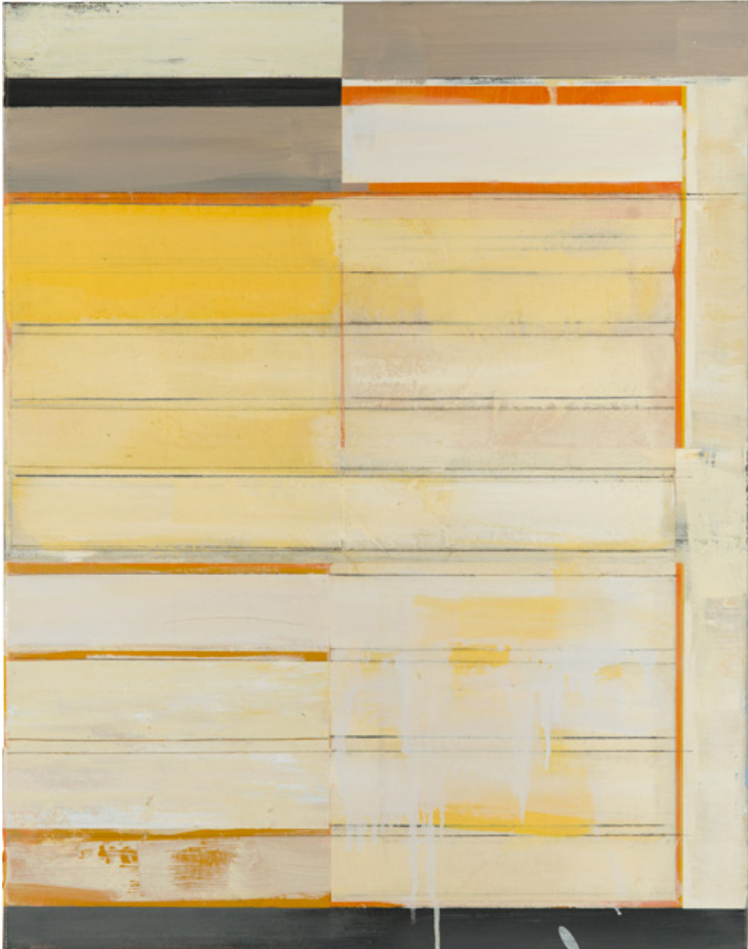
Lloyd Martin, Folio Series 6, 2013, oil on canvas, 28 x 22 in (71.12 x 55.88 cm)