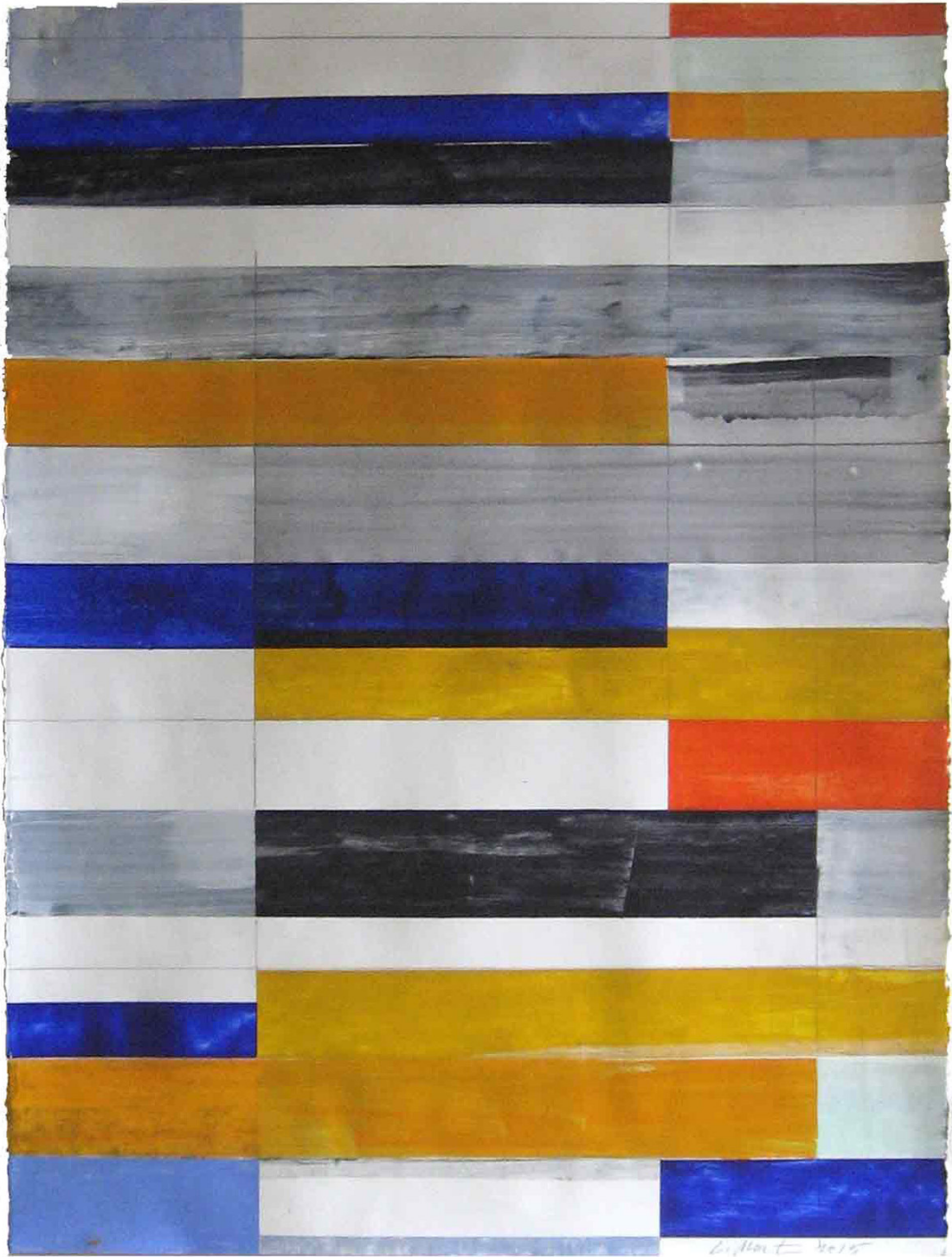
Lloyd Martin, Untitled 1508, 2015, oil on paper, 30 x 22 in (76.2 x 55.9 cm)