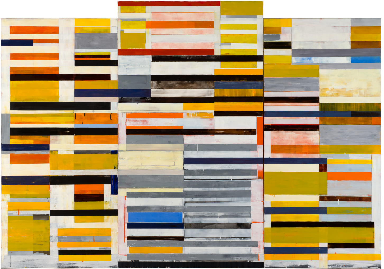
Lloyd Martin, Large Alloy, 2013, oil on canvas, 92 x 130 in (233.7 x 330.2 cm)