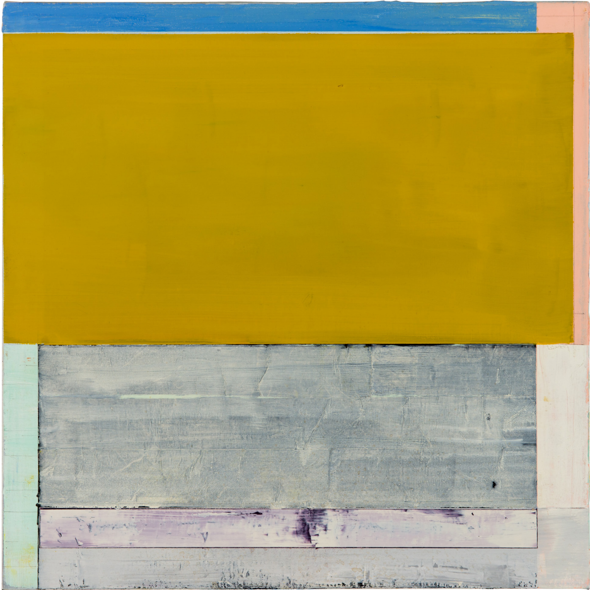
Lloyd Martin, Shim Series 15, 2013, oil on canvas, 24 x 24 in (60.96 x 60.96 cm)