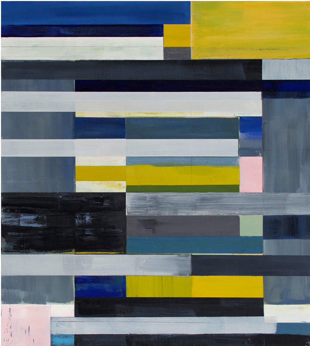
Lloyd Martin, Blue Char, 2015, oil on canvas, 40 x 36 in (101.6 x 91.44 cm)