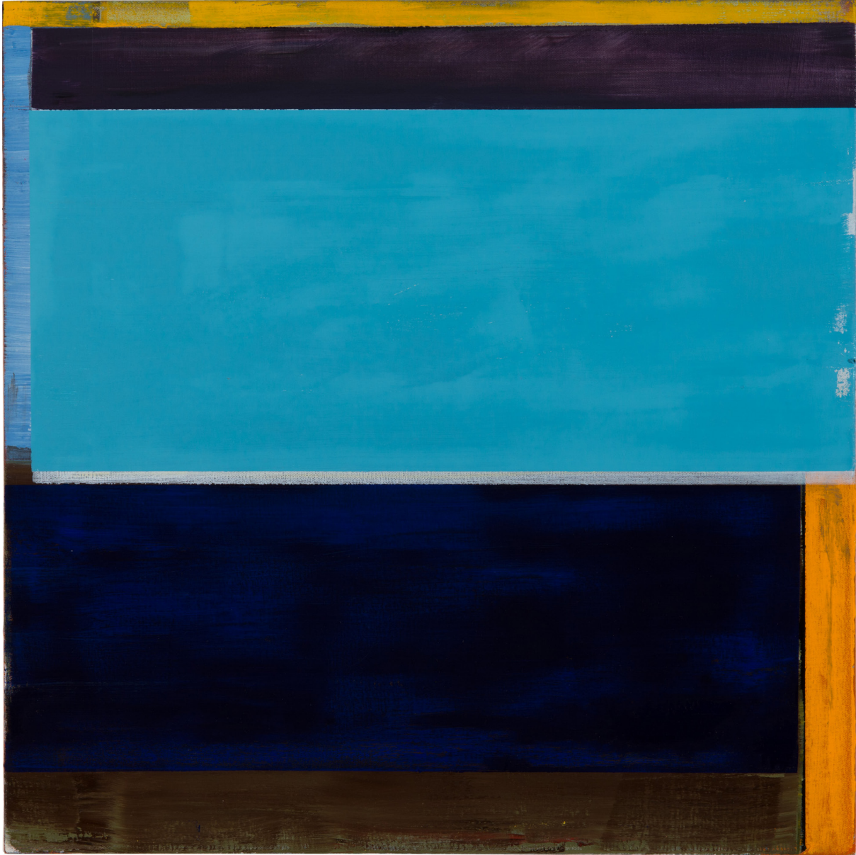
Lloyd Martin, Shim Series 17, 2013, oil on canvas, 24 x 24 in (60.96 x 60.96 cm)