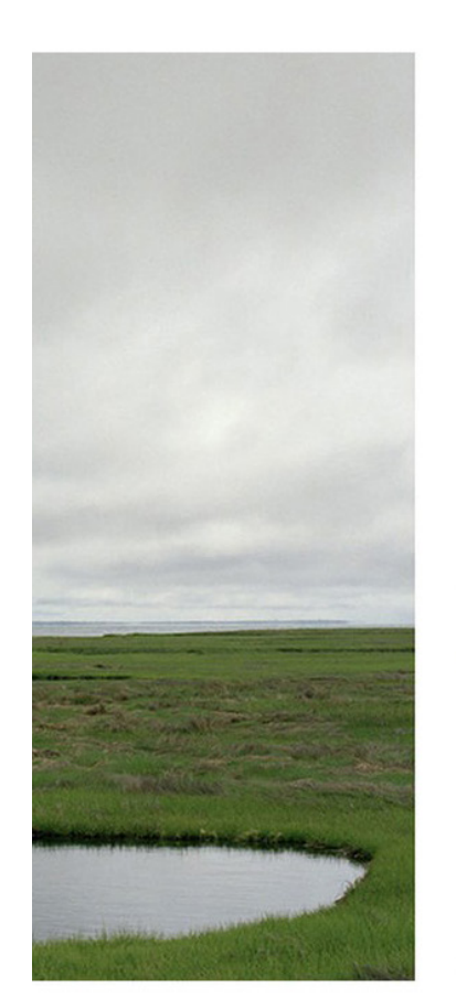
POOLS: Mighty Plentitude