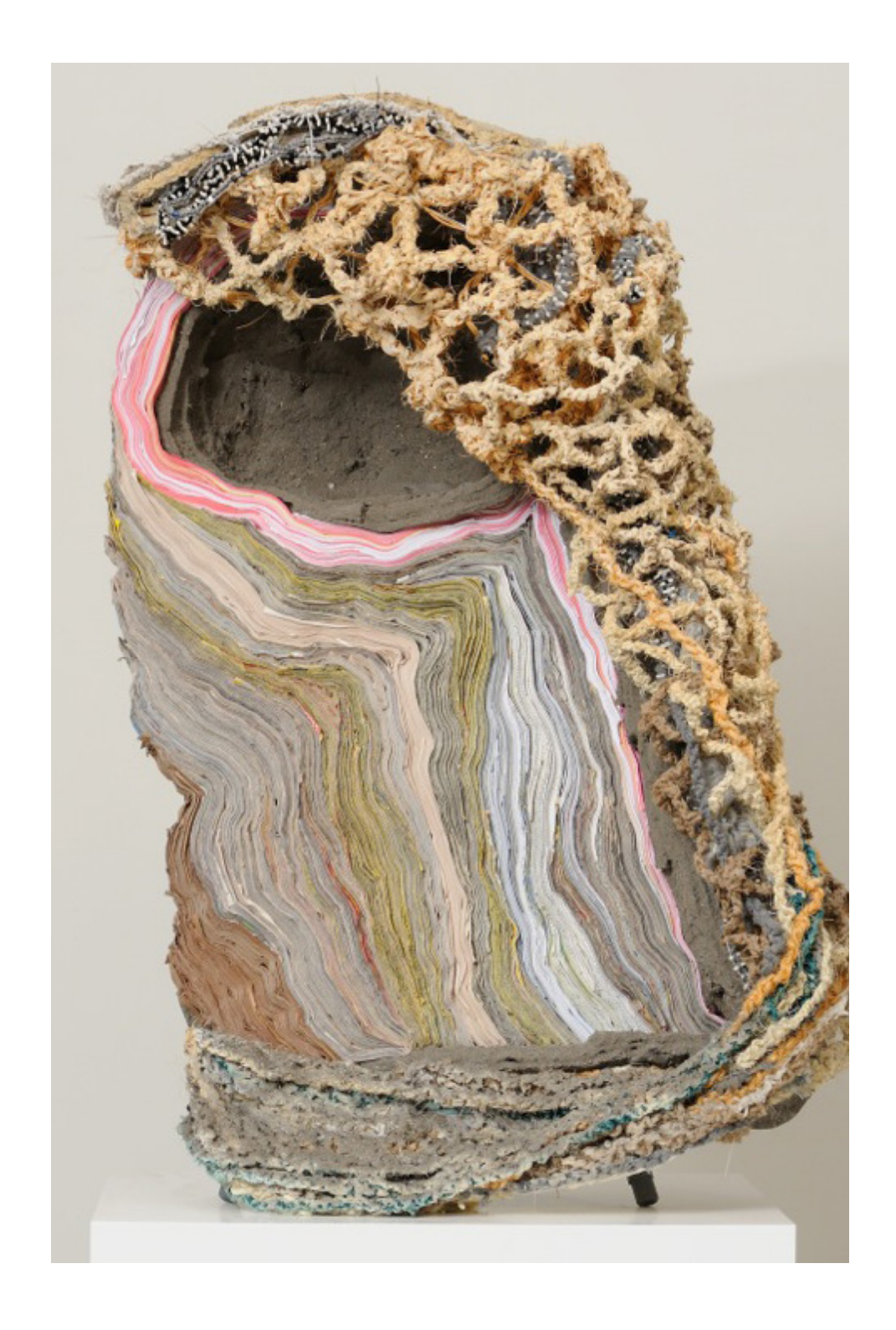
Steven Siegel, Went to Iceland #2, (2012), mixed media, 50 x 29 x 25 in.; 127 x 73.66 x 63.5 cm.