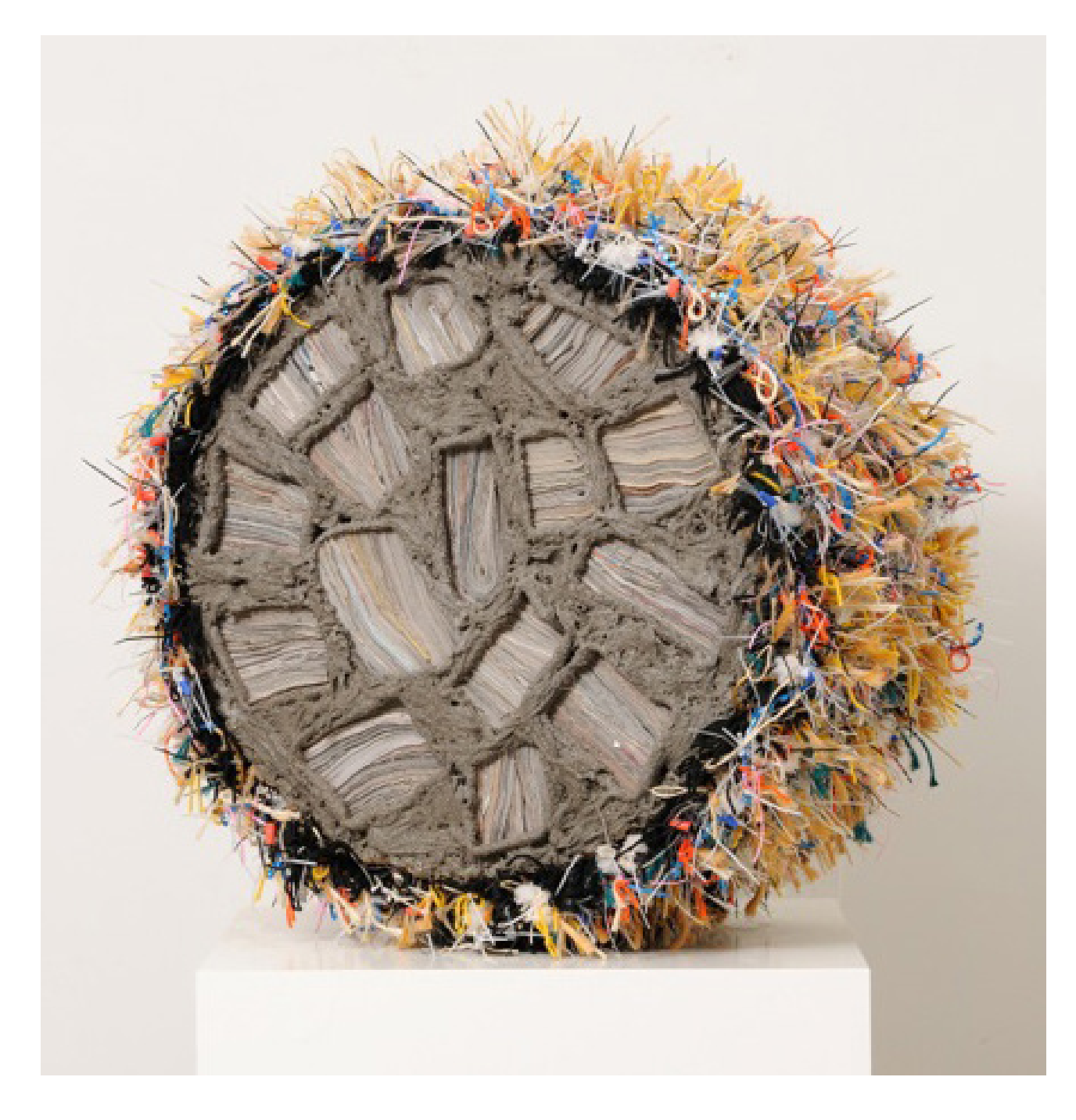
Steven Siegel, How it Happens #1, (2013), mixed media, 32 x 32 x 20 in.; 81.28 x 81.28 x 50.8 cm.