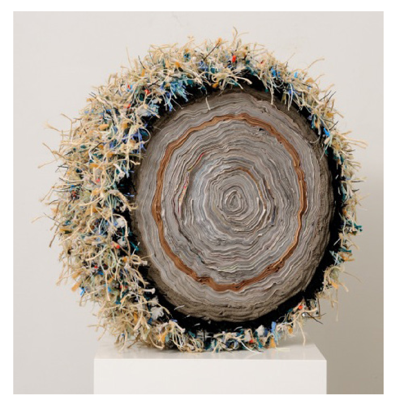
Steven Siegel, How it Happens #2, (2013), mixed media, 36 x 36 x 14 in.; 91.44 x 91.44 x 35.56 cm.