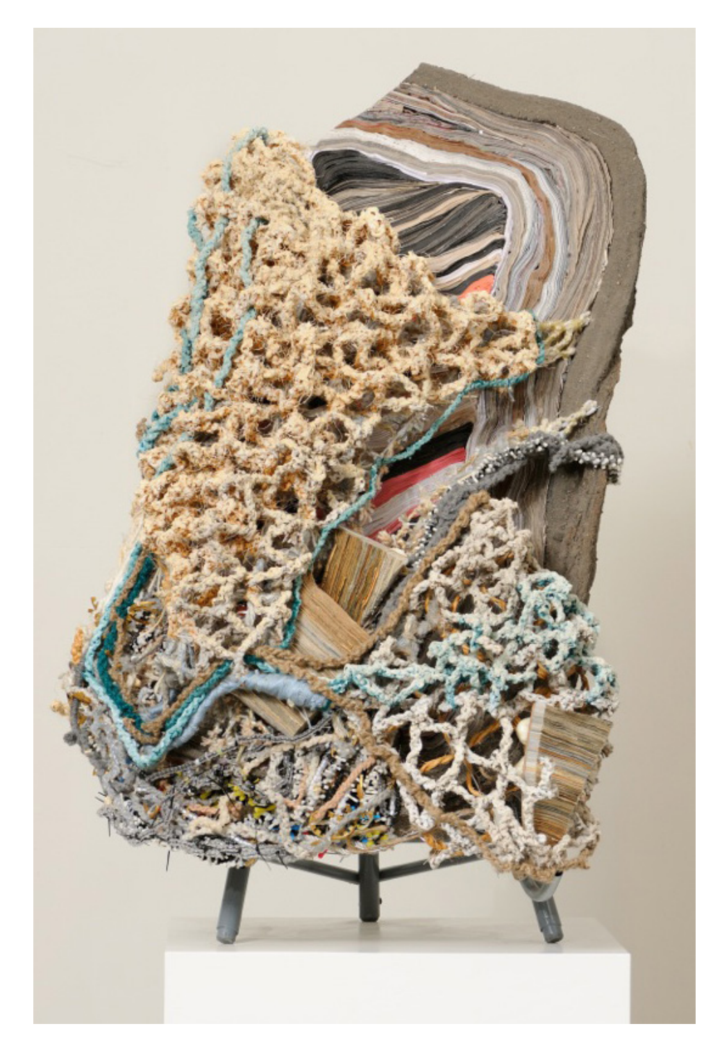
Steven Siegel, Went to Iceland #1, (2012), mixed media, 50 x 29 x 25 in.; 127 x 73.66 x 63.5 cm.