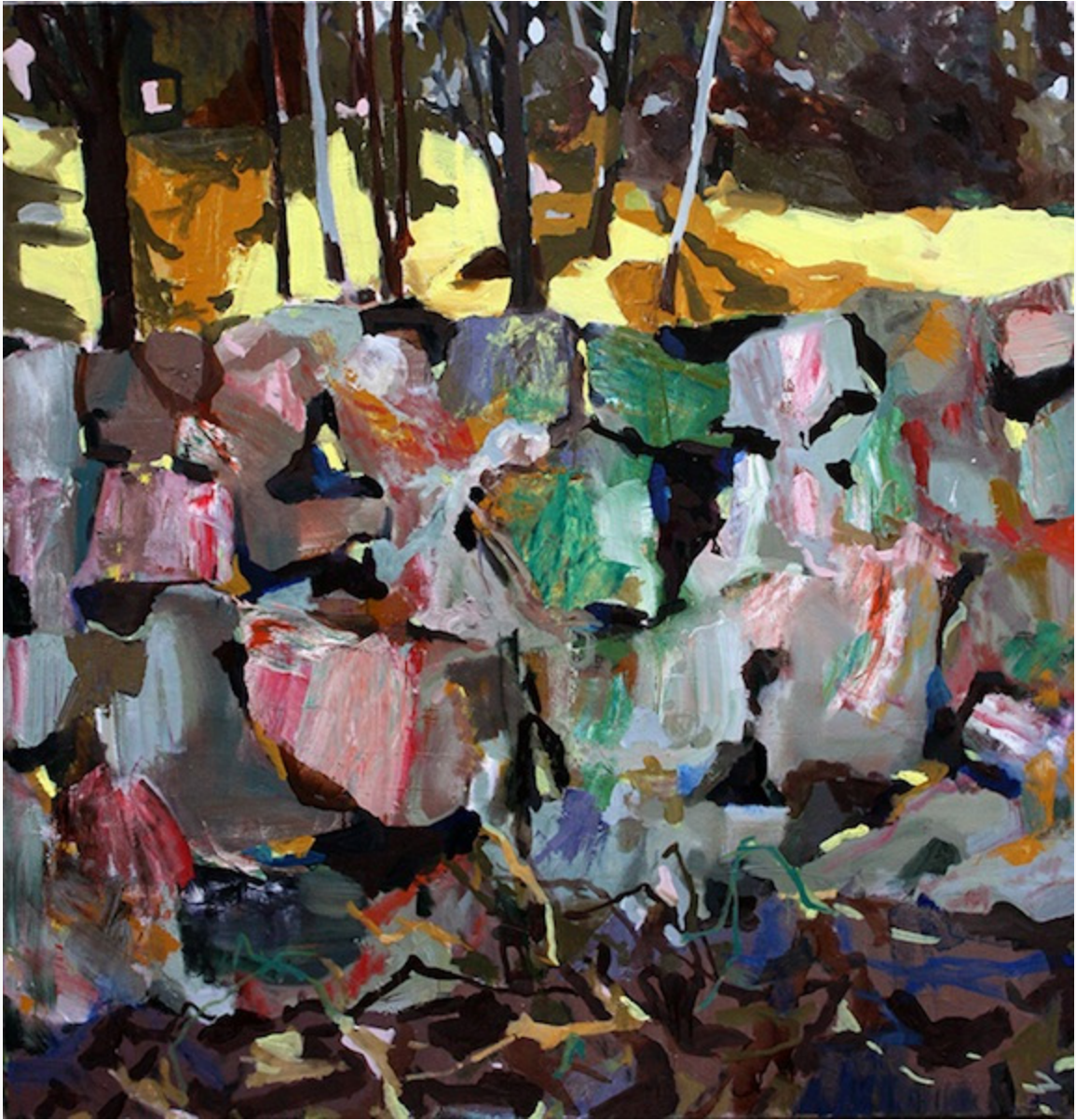
Walled Off (2013) by Allison Gildersleeve