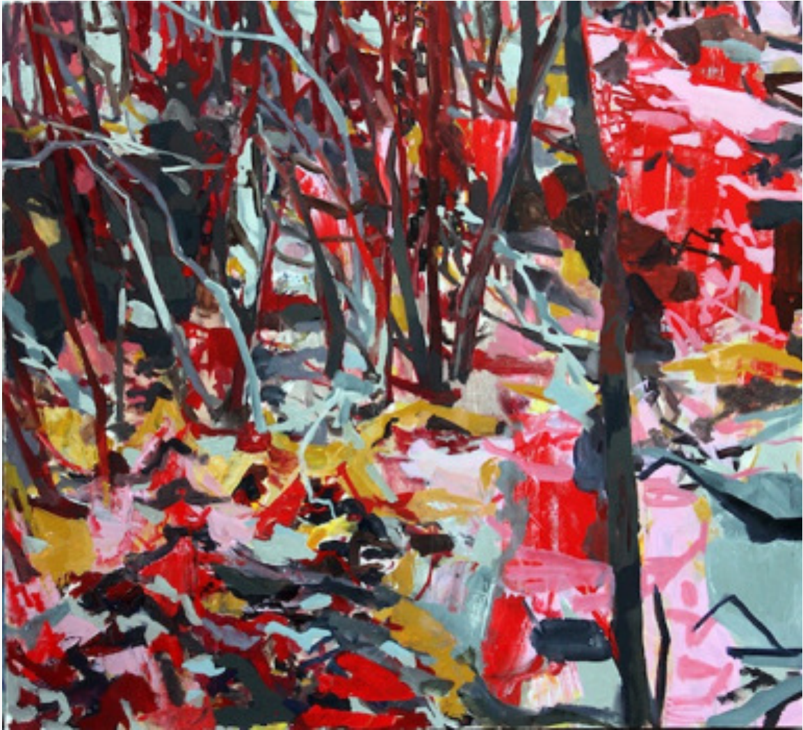
Foothold (2014) by Allison Gildersleeve

Looking for Cover (2013) demonstrated the jumbled universe that is created but the brilliant touches of acrid green with some streaks of purple representing vein like roots which could easily convey a modernistic landscape. It can also be looking inside the chamber of a heart where all these veins meet. The transitive experience is subtle and not forced as one is transported from one type of scene to the next. Foothold (2014) with the dense browns and fiery reds pulsated with the same vibrancy and electricity. It can be the woodland of dreams or hallucinated hell based on what one felt or made of the canvas. There is a freedom of choice to unabashedly make an interpretation. The propensity of being transported elsewhere is not by force but by sheer voluntary escapism afforded through the rich hued and static formation of Gildersleeve's oeuvre.