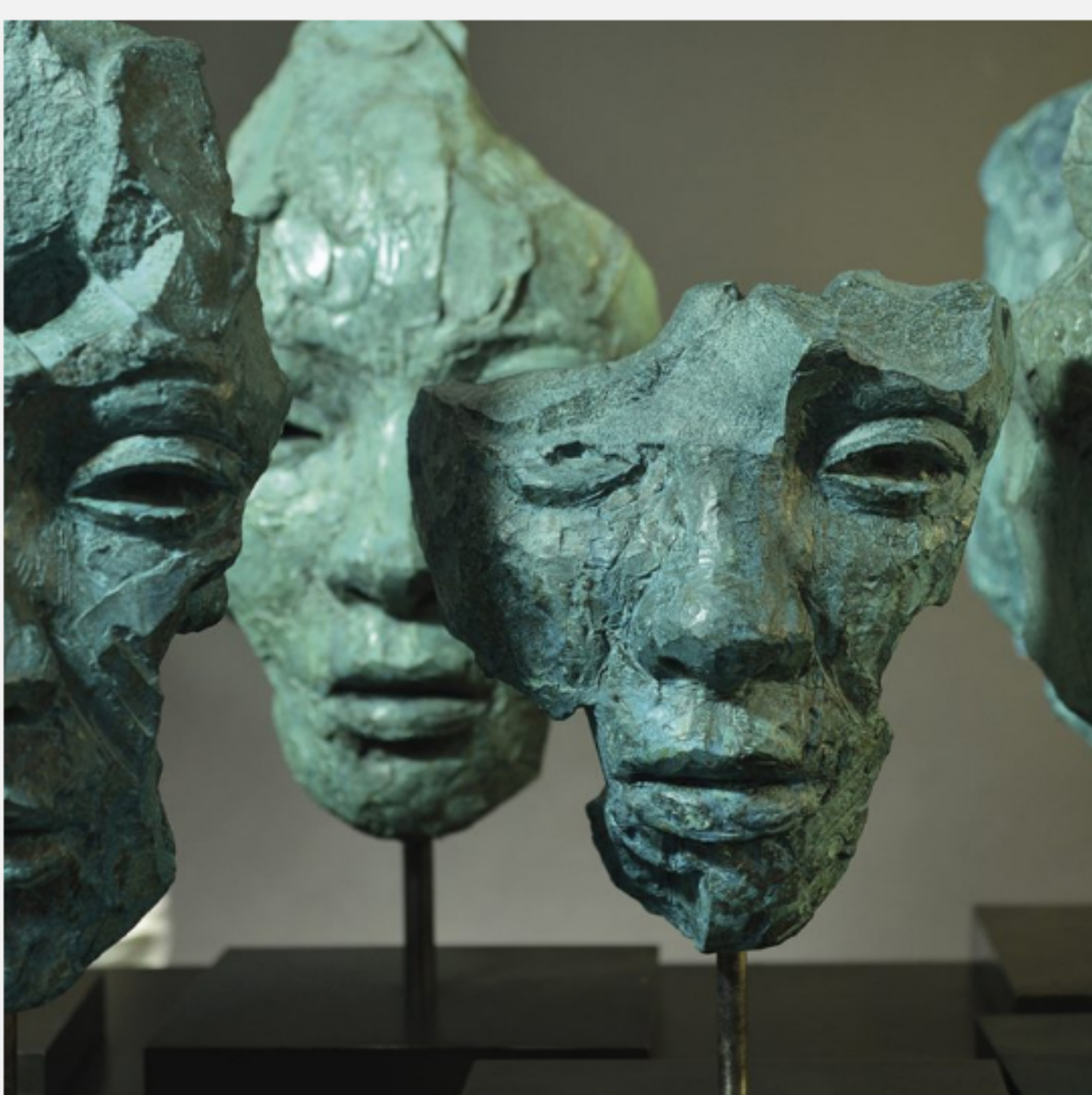
Images: Singular formation #2 (left), Origin Broken Fragments , close-up (right)

After settling in Cape Town the artist became internationally recognised and his exhibitions in Great Britain, Holland, the USA and Hong Kong have been exceptionally popular among the art public and collectors.