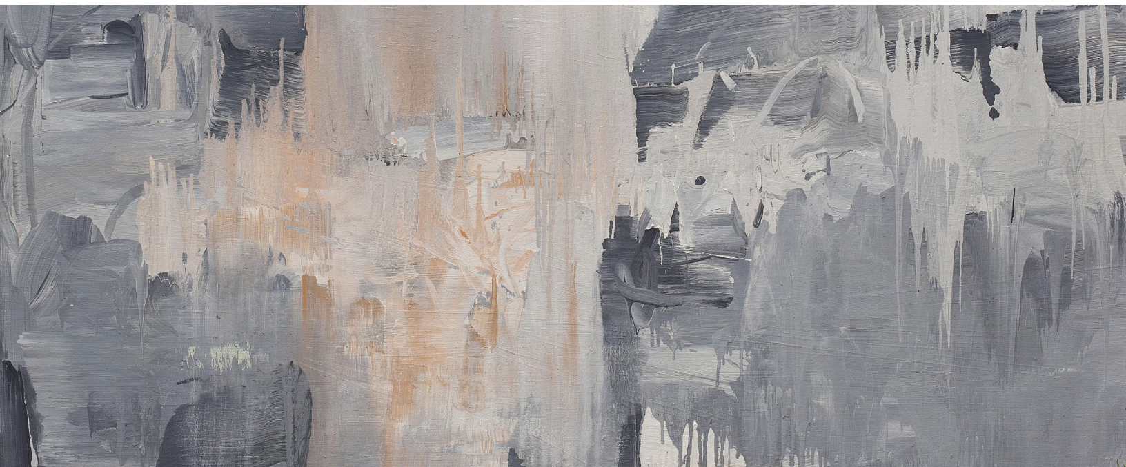
Lianghong Feng, Composition 11-56 , 2011, oil on canvas, 79 x 98 inches

March 18 - April 29, 2017 The Barn at 28 Main, Walpole, NH