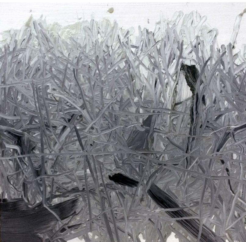
Lianghong Feng, Untitled 2-06 , 2009, oil on canvas, 16 x 16 inches