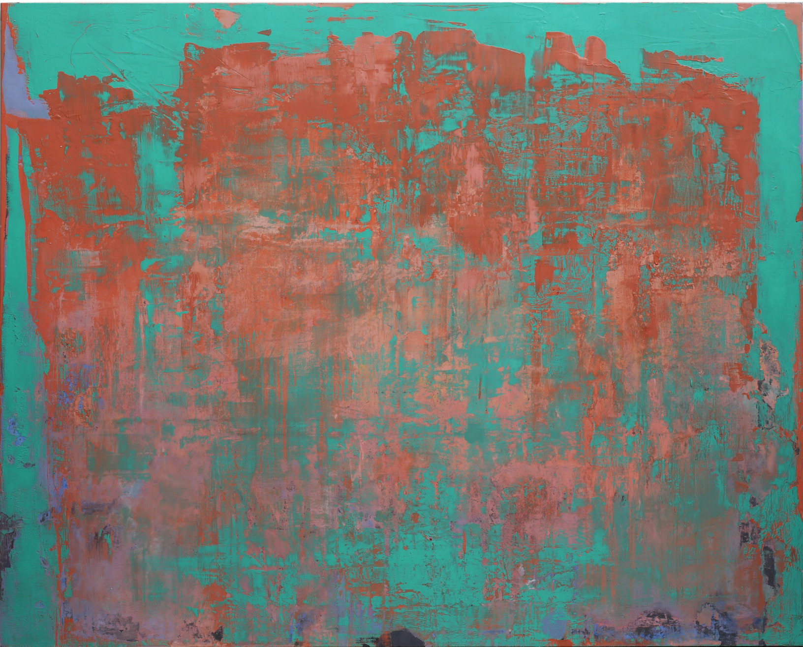
Lianghong Feng, Composition 13-3 , 2012, oil on canvas, 79 x 98 inches