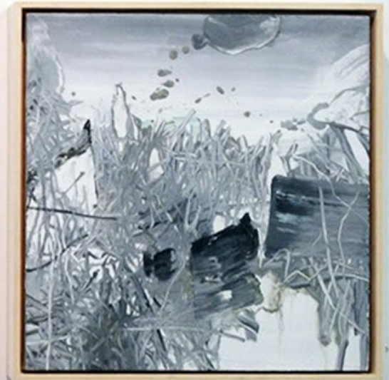
Lianghong Feng, Untitled 1-06 & Untitled 2-06 , 2009, oil on canvas, 16 x 16 inches