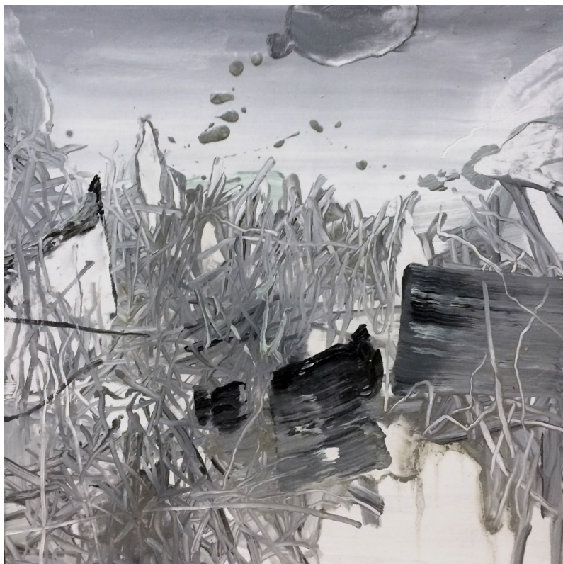
Lianghong Feng, Untitled 1-06 , 2009, oil on canvas, 16 x 16 inches