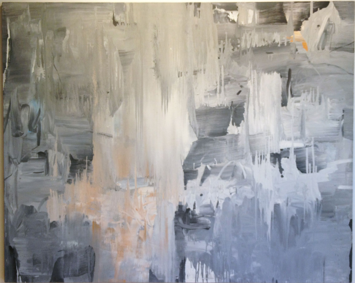
Lianghong Feng, Composition 11-56 , 2011, oil on canvas, 79 x 98 inches