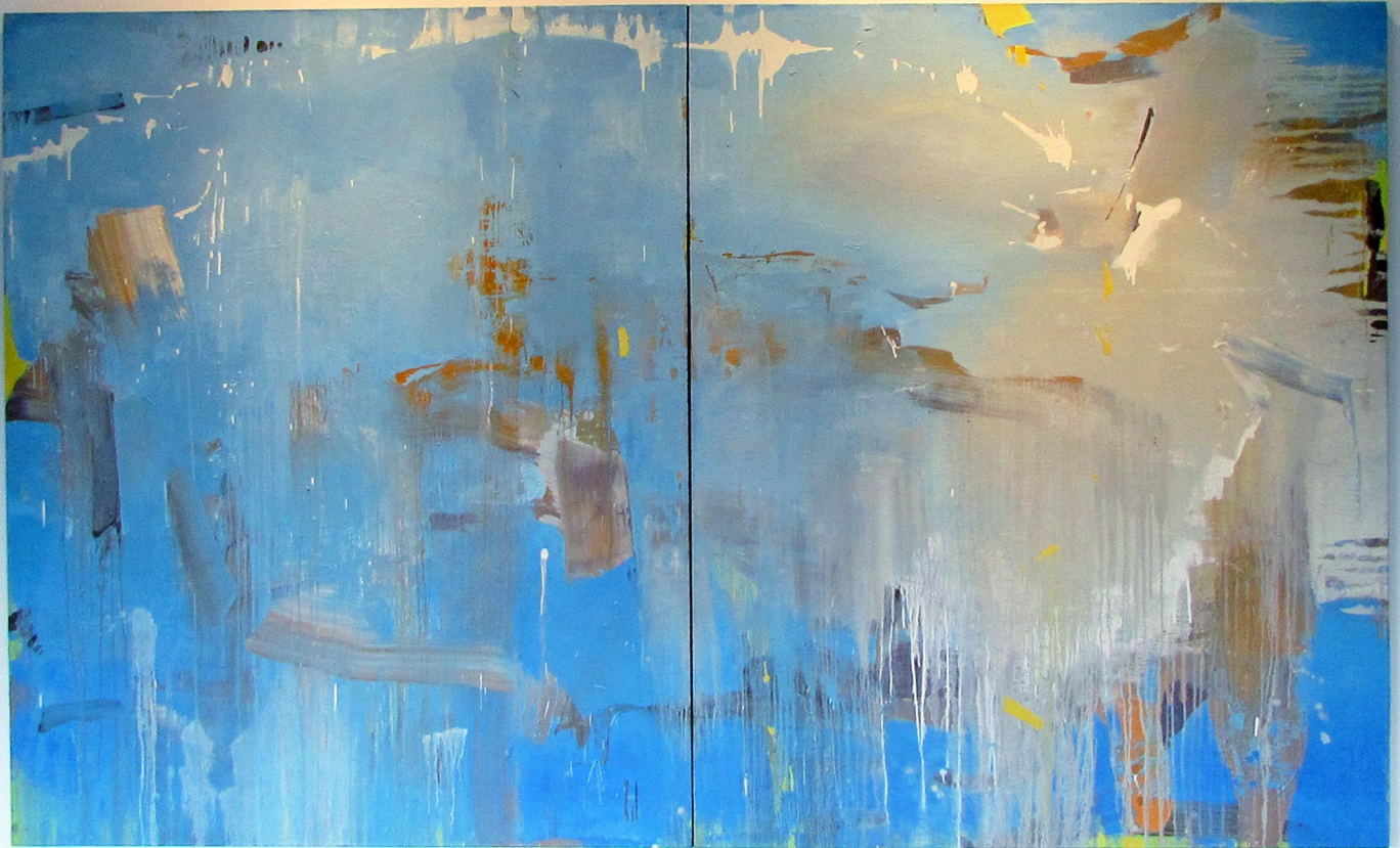
Lianghong Feng, Composition 11-67 , 2011, oil on canvas, 74 x 118 inches