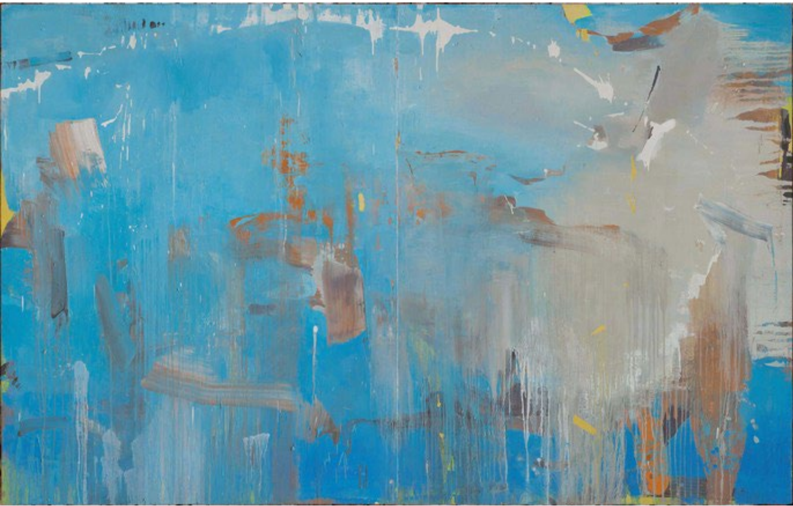
Lianghong Feng, Composition 11-67 , 2011, oil on canvas, 74 x 118 inches