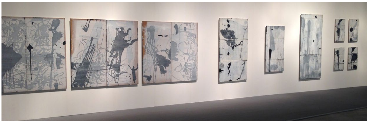
Lianghong Feng, Installation at Venice Biennale, 2015