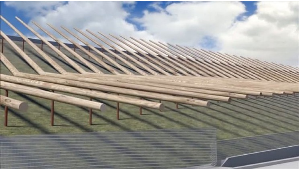
Denver International Airport