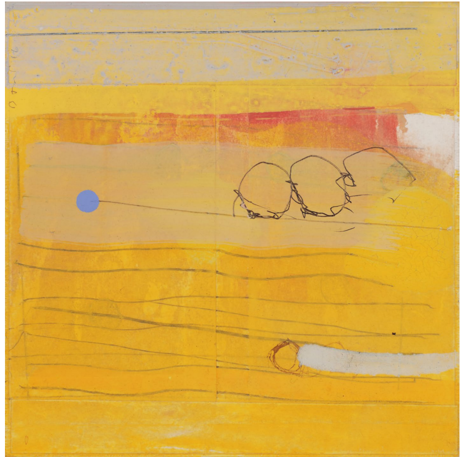
Doug Trump, Yellow and Friends , 2016 oil, pencil and collage on wood panel, 5 3/4 x 5 3/4 inches