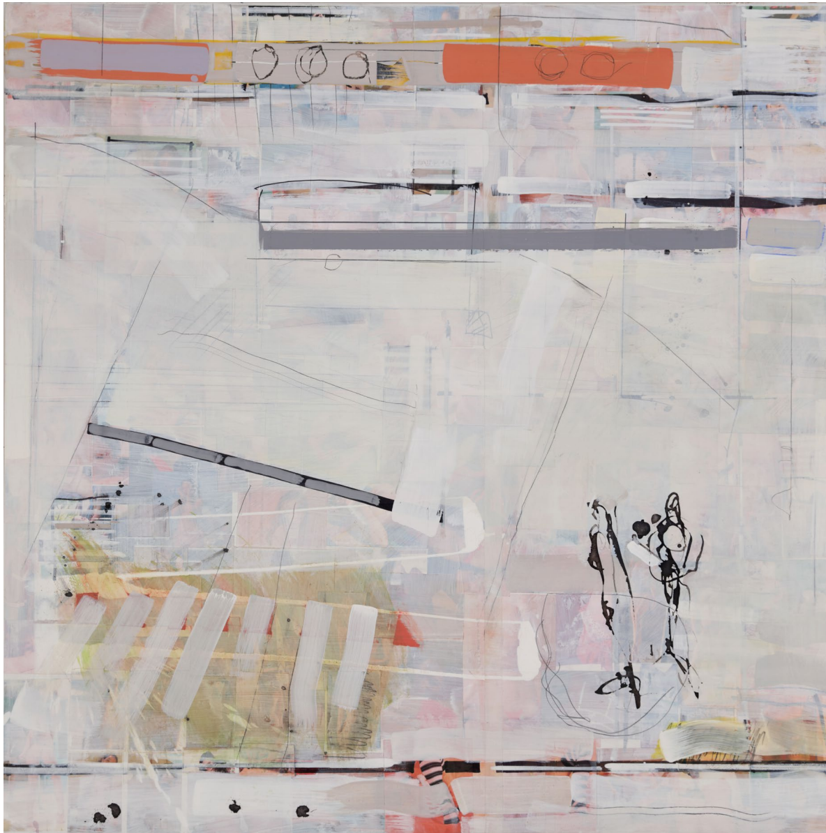
Doug Trump, Prudence , 2017 oil, pencil, collage, ink and marker on polymesh, 46 x 46 inches