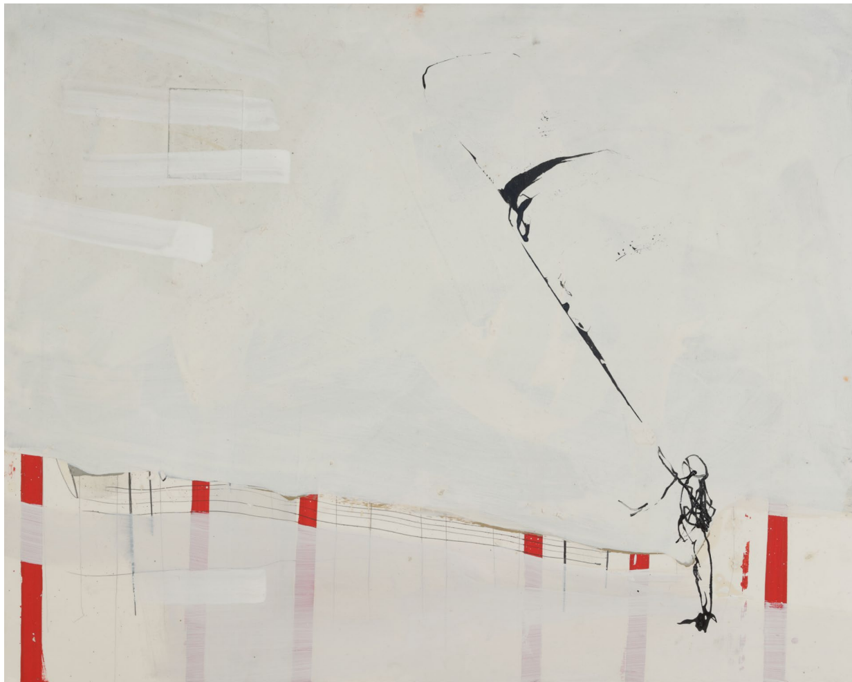
Doug Trump, Oh Plainfield , 2012 oil, pencil, collage and ink on paper, 32 x 40 inches