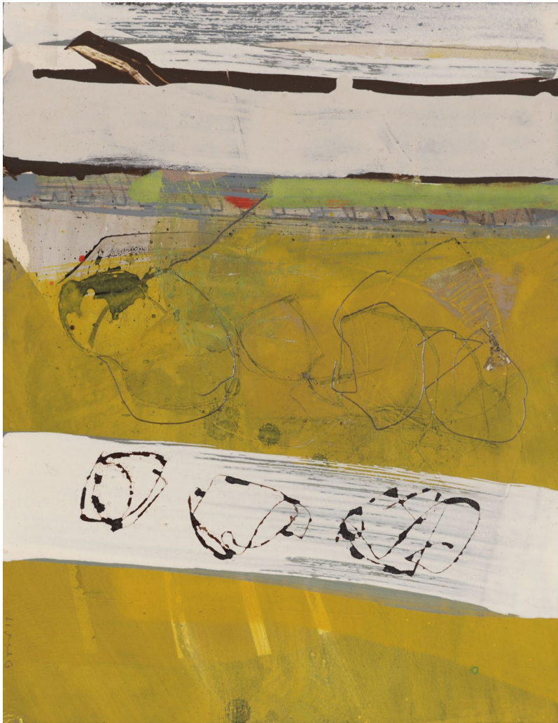
Doug Trump, Replenished , 2017 oil, pencil, collage and ink on archival museum board, 9 x 7 inches