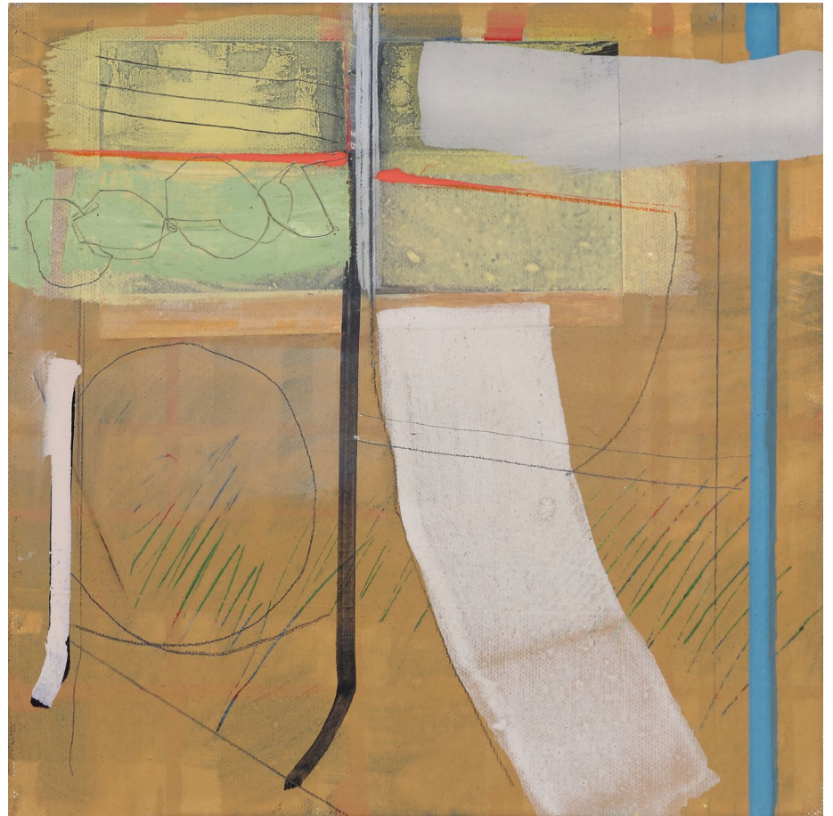
Doug Trump, Leyden , 2016 oil, pencil, collage and marker on canvas, 10 x 10 inches