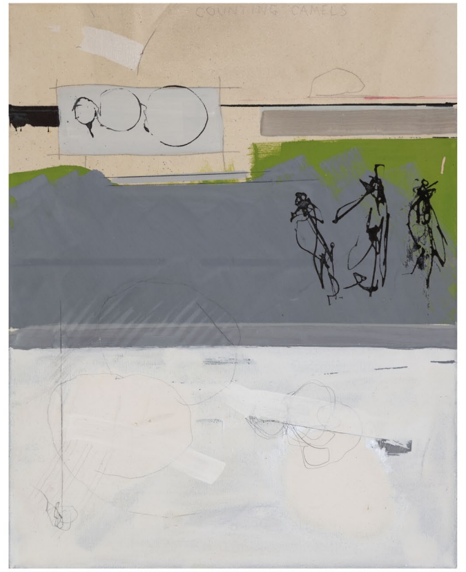
Doug Trump, Counting Camels , 2017 triptych oil, pencil, marker and ink on canvas, 33 x 75 inches