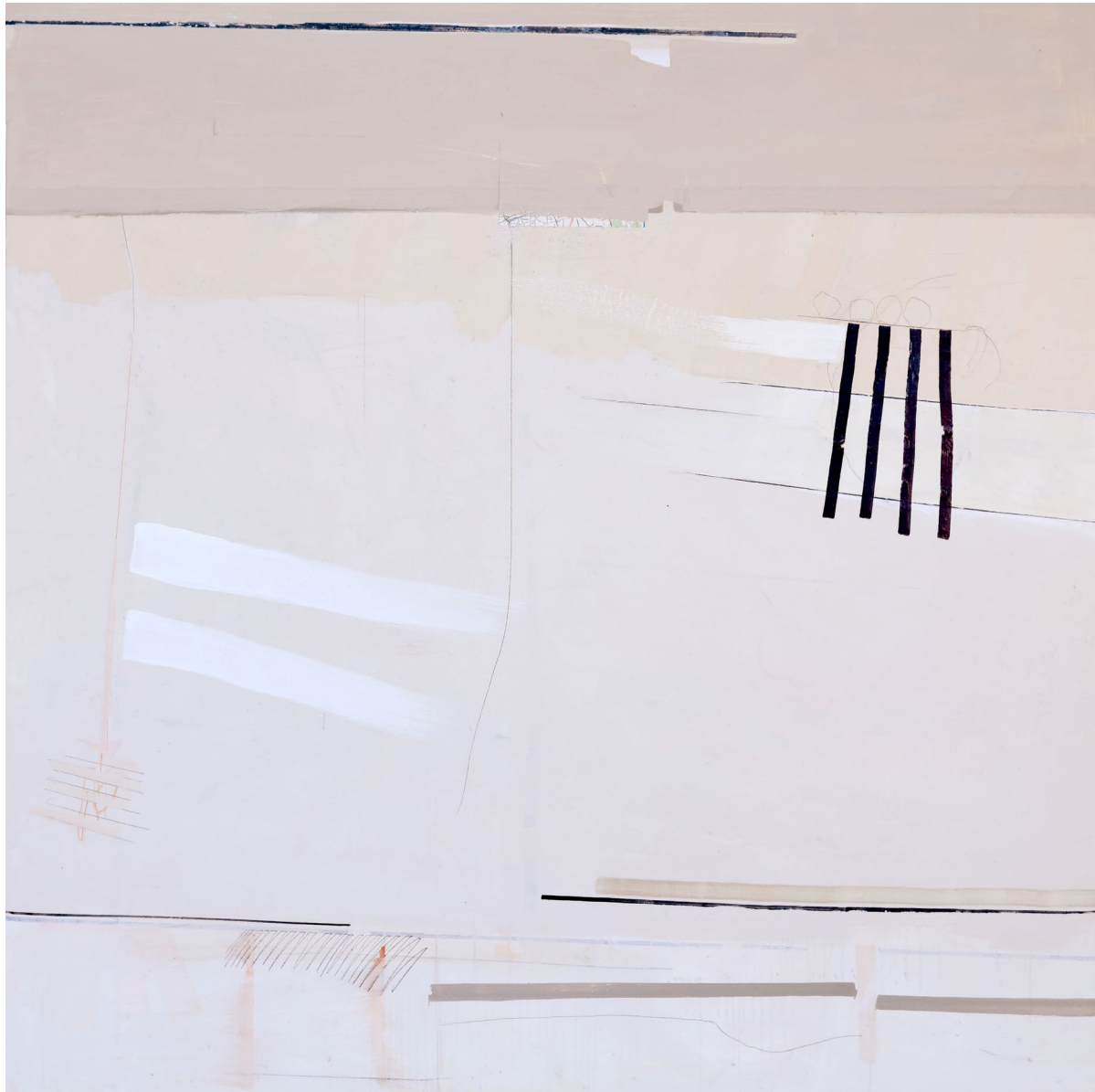
Doug Trump, Swimmers , 2016 oil, pencil, collage, ink and marker on canvas, 60 x 60 inches