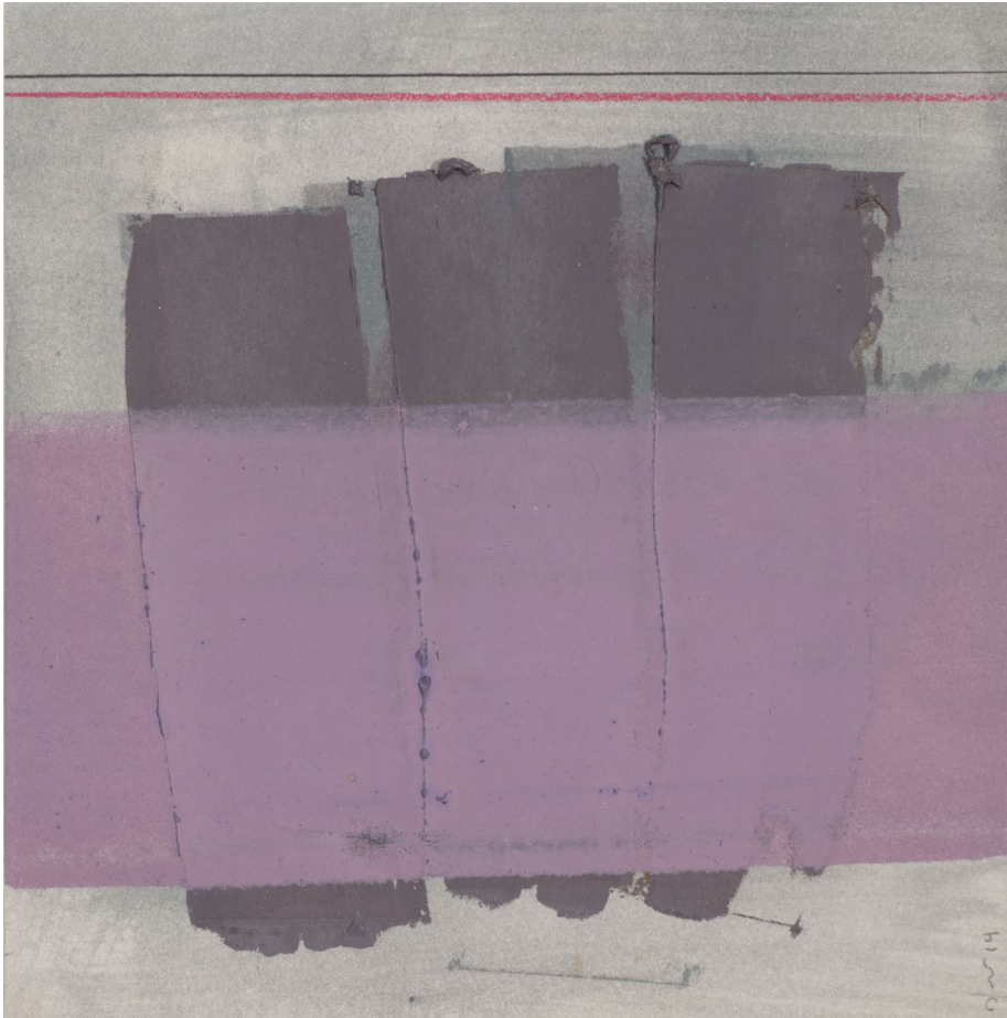
Doug Trump, Bound , 2014 oil and pencil on archival museum board, 6 x 6 inches