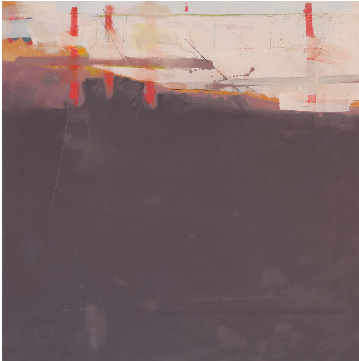
Doug Trump, Maiden , 2014 oil, pencil, collage and ink on canvas, 46 x 46 inches