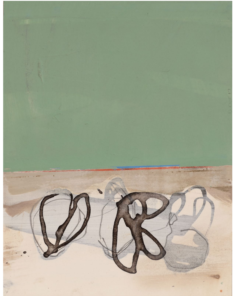
Doug Trump, Above , 2017 oil, pencil, collage and ink on archival museum board, 9 x 7 inches