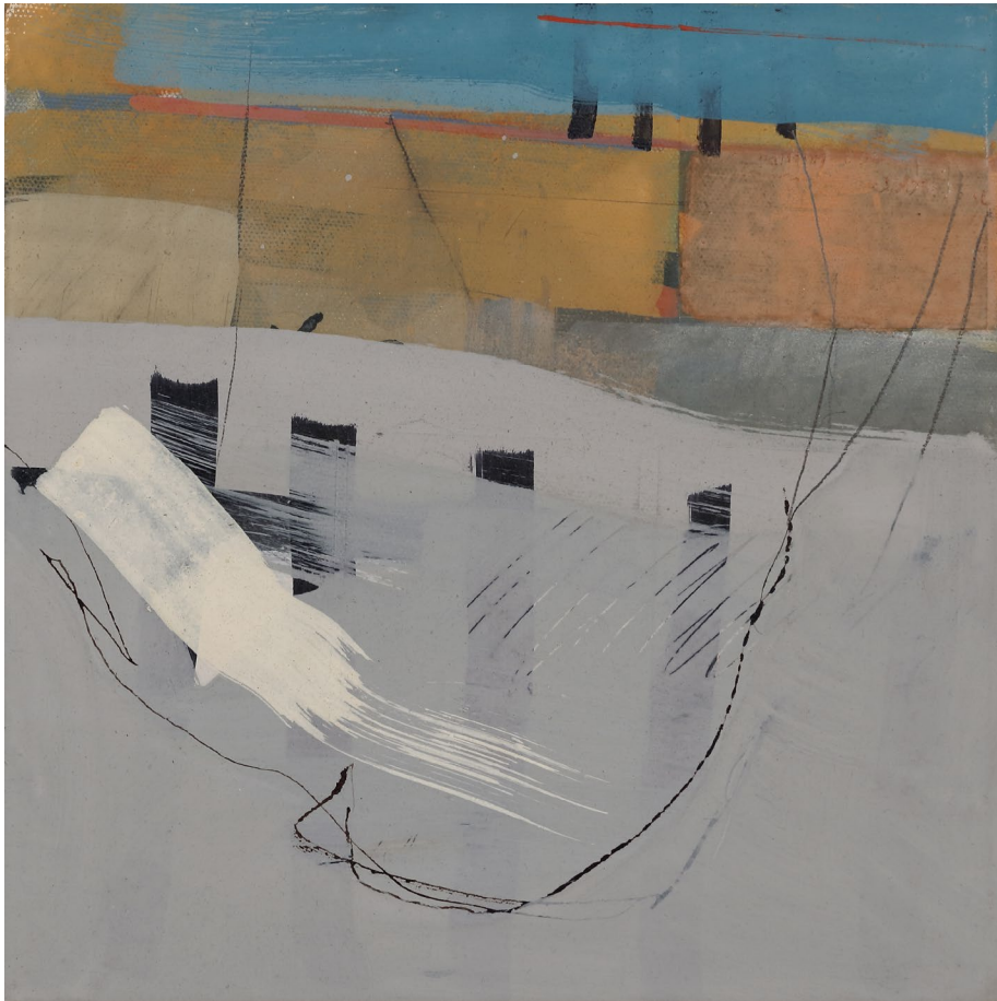
Doug Trump, Visitor , 2016 oil, pencil, collage, ink and marker on canvas, 10 x 10 inches