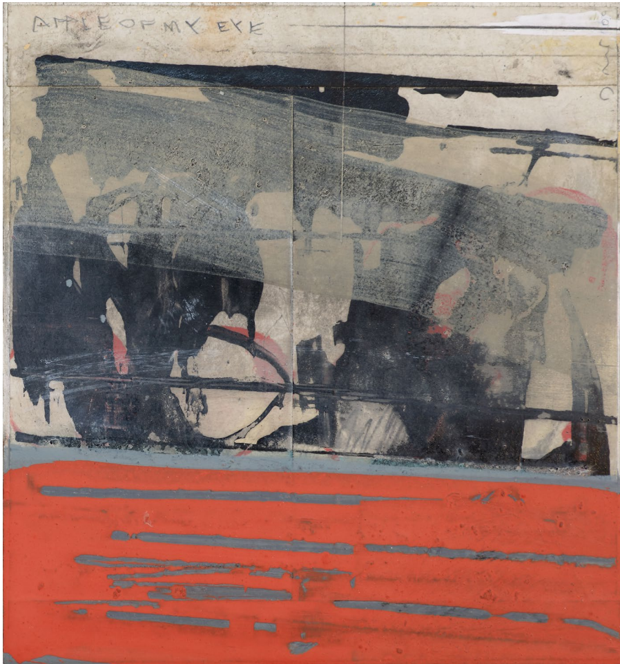
Doug Trump, Found , 2015 oil, pencil, collage and ink on wood panel, 5 \frac{3}{4} x 5 \frac{3}{4} inches