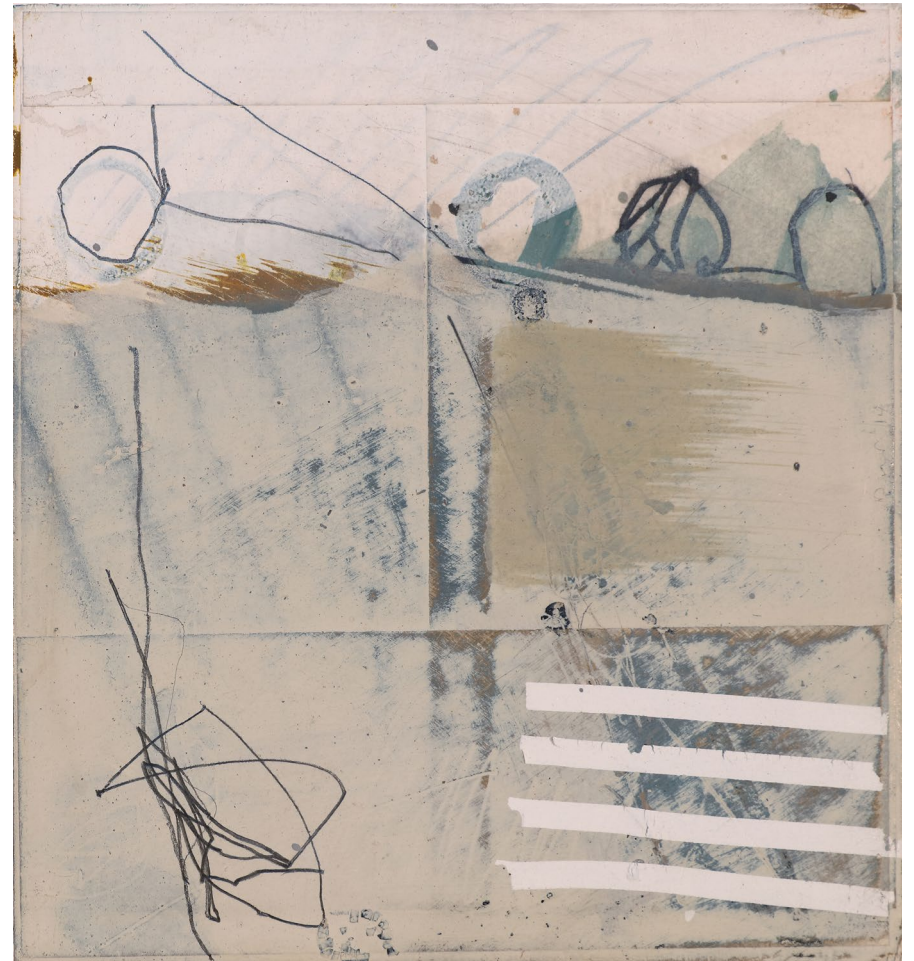
Doug Trump, Bobbers , 2014 oil, pencil, and collage on wood panel, 5 \frac{3}{4} x 5 \frac{3}{4} inches