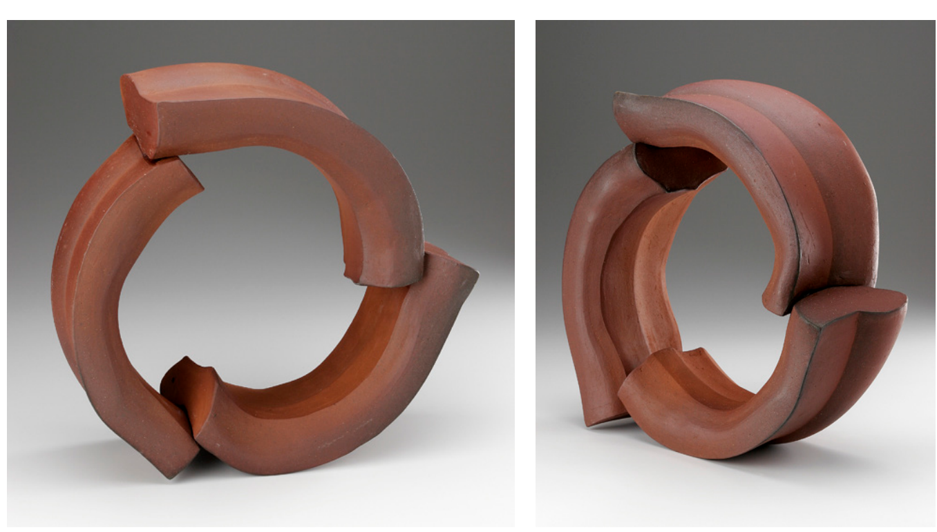
Malcom Wright, Three Part Ring, 2006, wood fired brick clay, 14 ½ x 15 ½ x 5 ½ inches

Contact: Kristen Jussila, Marketing, k_jussila@cynthia-reeves.com, 413.398.5257