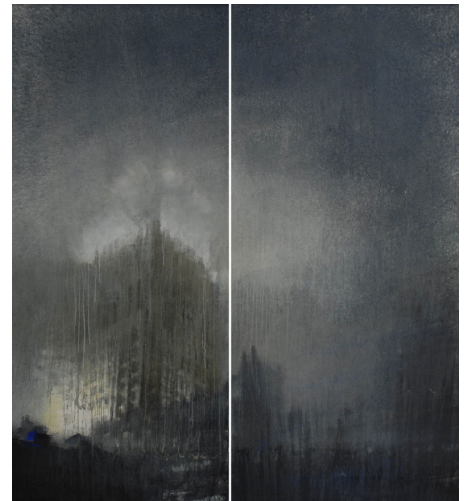
Paul Ching-Bor, Insomnious Lights , 2009 watercolor on paper, 114 x 103 inches

Ching-Bor has reconsidered the qualities of watercolor that are often thought to be intrinsic to the medium, such as sensitivity, delicacy, and transparency. According to him, his images are "not so transparent, not so spontaneous in some parts, and not so 'watercolor' anymore. They are the substantial, developed face of watercolor painting." This approach is robust and dynamic; at the same time, the works have a quiet intensity in their melancholic and stark qualities.