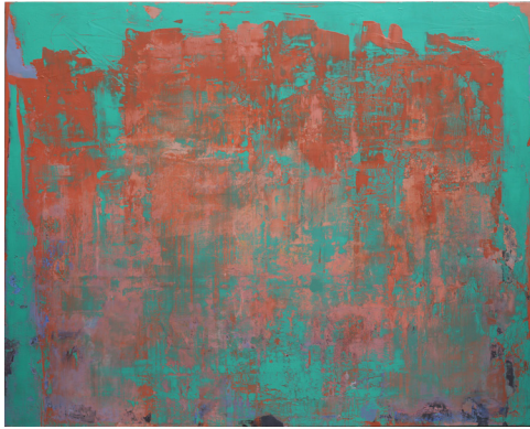
Lianghong Feng, Composition 13-3 , 2012 oil on canvas, 79 x 98 ½ inches

Lianghong Feng has been painting in the Abstract Expressionist style for over two decades, and he has now become one of the most influential contemporary painters in this genre in China. His lush surfaces speak of the dialog between the artist and canvas, a call and response between mark and brushstroke, of the application of color and the scribing back into the painted surface.