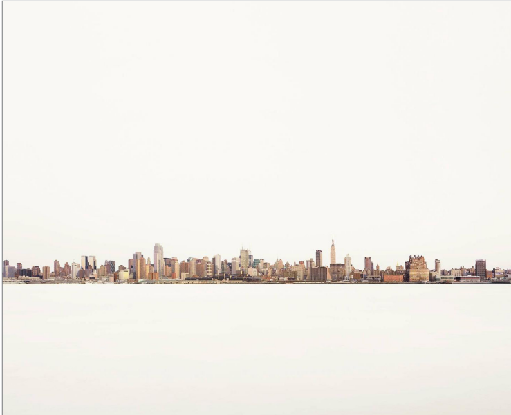
David Burdeny, New York City, USA , 2009, archival digital print, edition of 7, 32 x 40 inches

that extended moment of awareness. In my earlier architectural practice and now my photography career, I'm fascinated by the opportunity to invest symbols and narrative into built form or see the metaphor in a material space. I have an abiding interest in thresholds and liminality - places that seem somehow a bridge between the concrete and the ephemeral, elevated above time, hallowed.