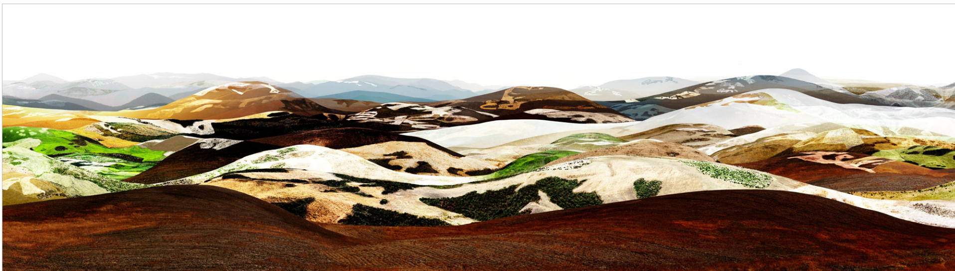
Georg Küttinger, Kreta , 2014 archival pigment print, edition of 5, 29 ½ x 106 ¼ inches