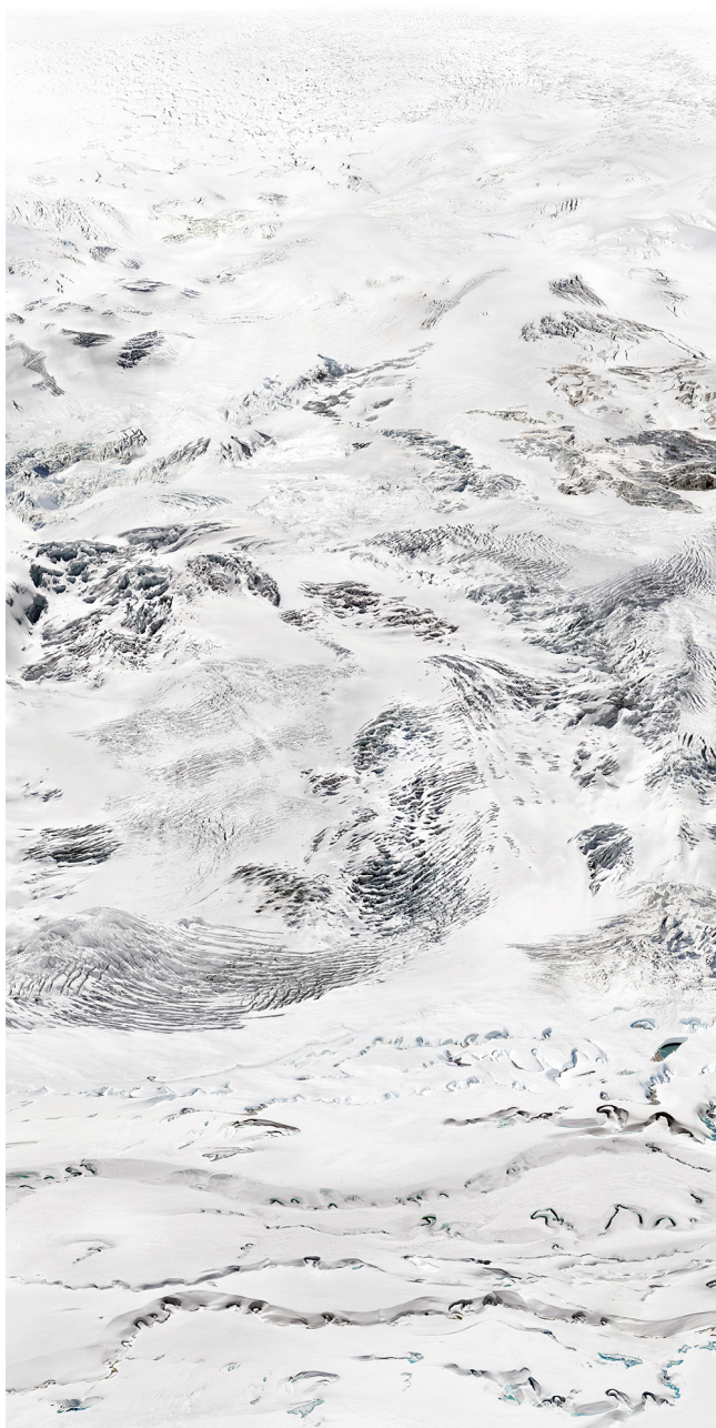
Georg Küttinger, Gornergletscher , 2016 archival pigment print, edition of 5, 78 ¾ x 39 ¼ inches