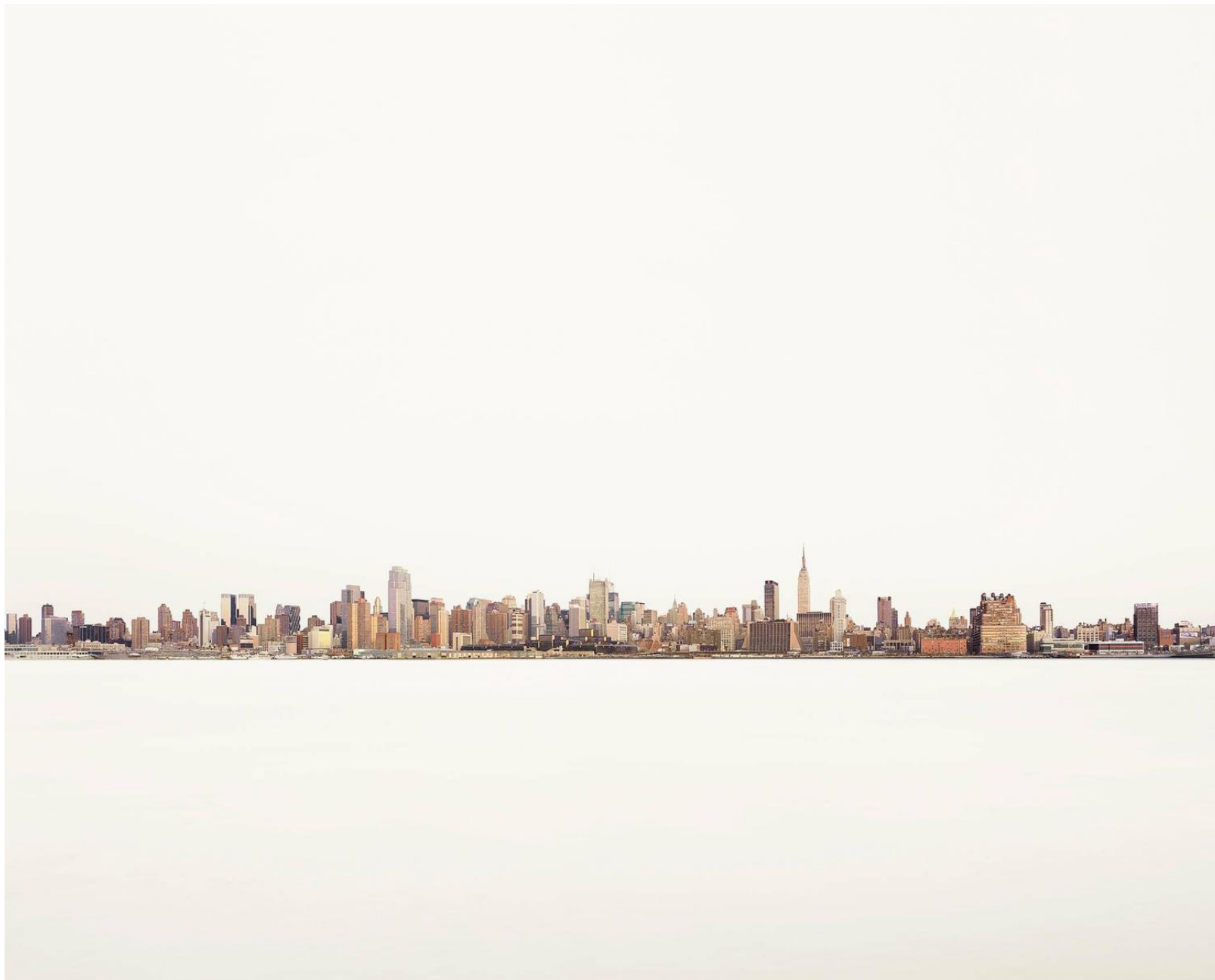
David Burdeny, New York City, USA , 2009 archival pigment print, edition of 7, 44 x 55 inches