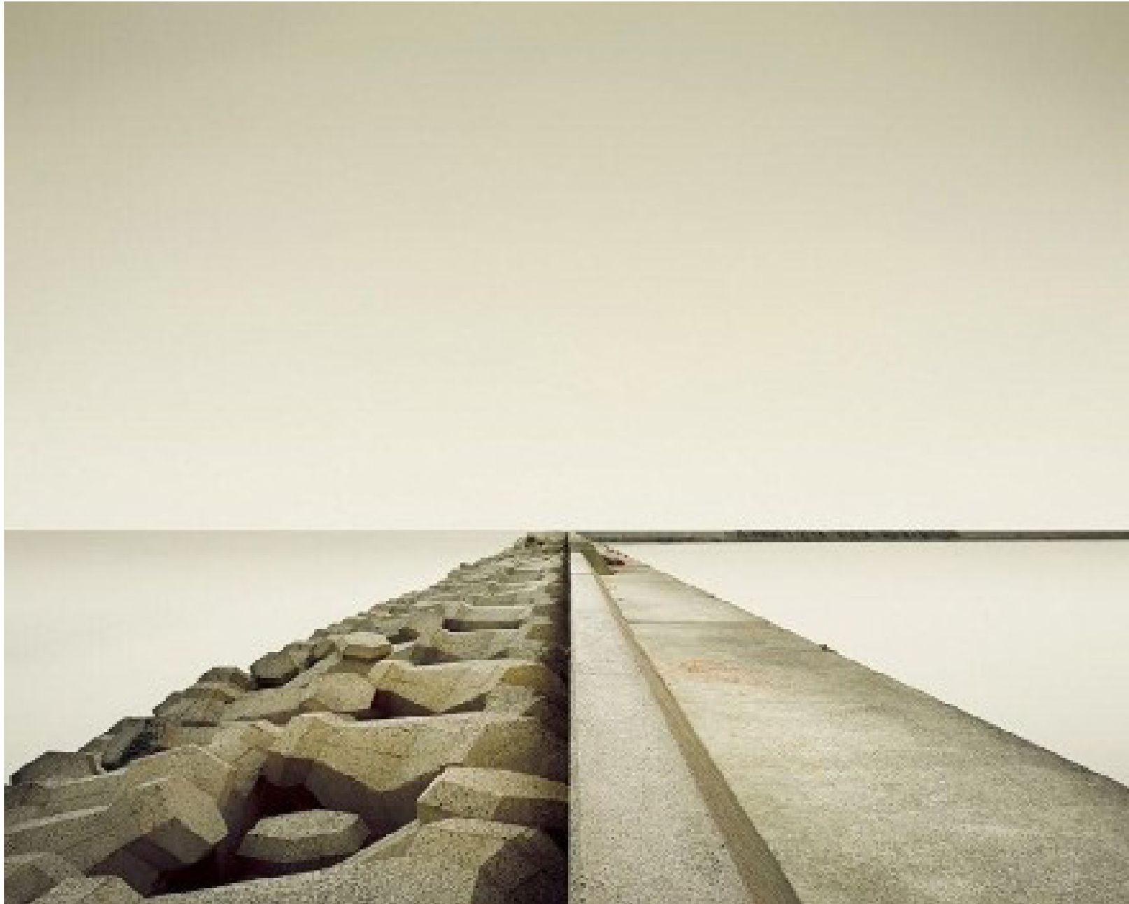
David Burdeny, Harbor Suo-Nado Sea Japan , 2010 archival pigment print, 32 x 40 inches