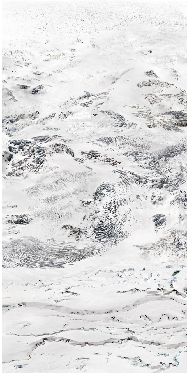
Georg Küttinger, Gornergletscher , 2016 archival pigment print, edition of 5, 78 ¾ x 39 ¼ inches