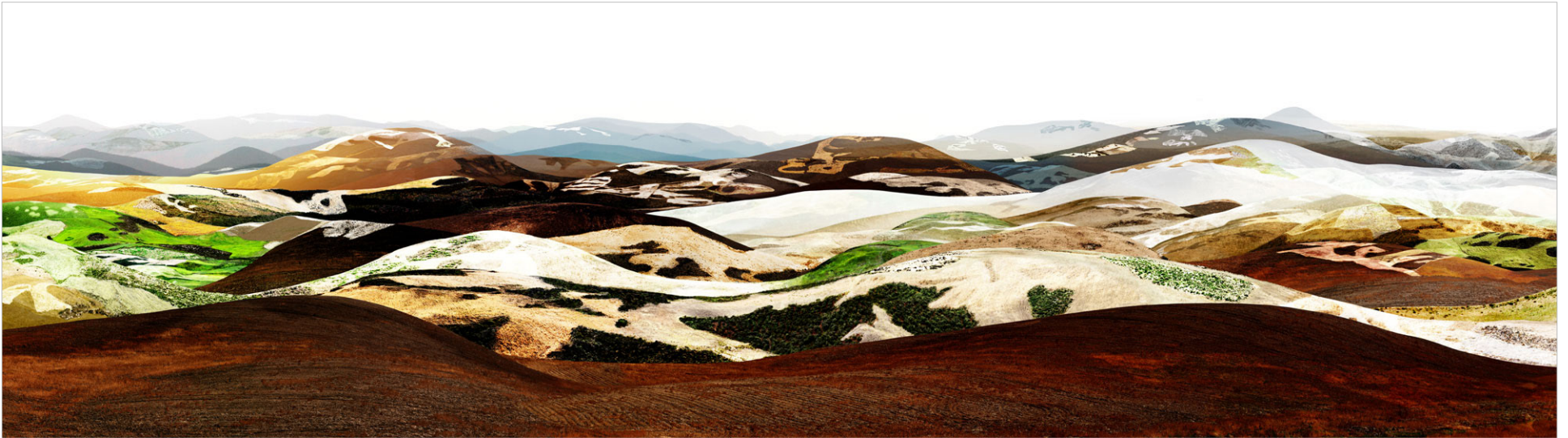
Georg Küttinger, Kreta , 2014 archival pigment print, edition of 5, 29 ½ x 106 ¼ inches