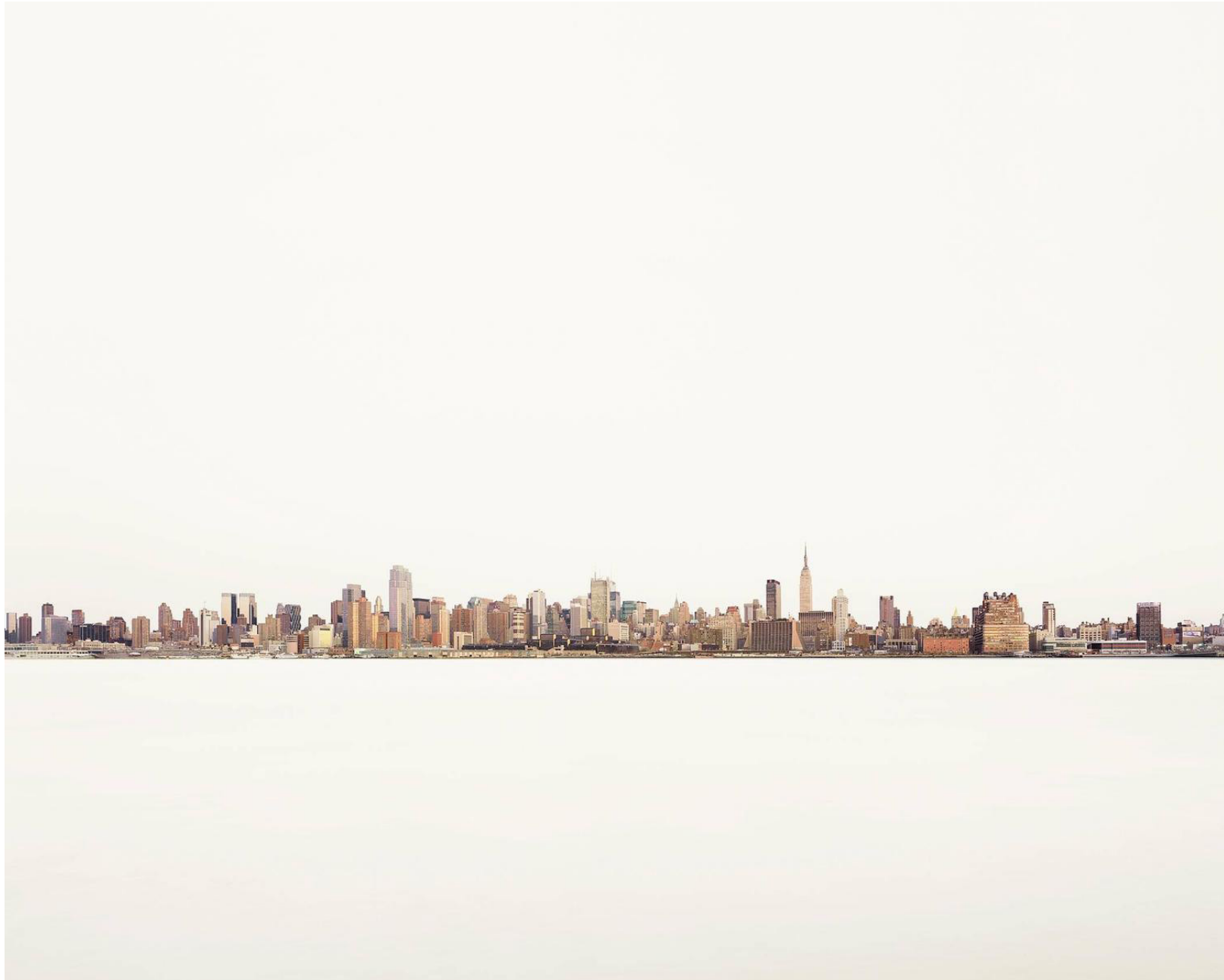
David Burdeny, New York City, USA , 2009 archival pigment print, edition of 7, 44 x 55 inches