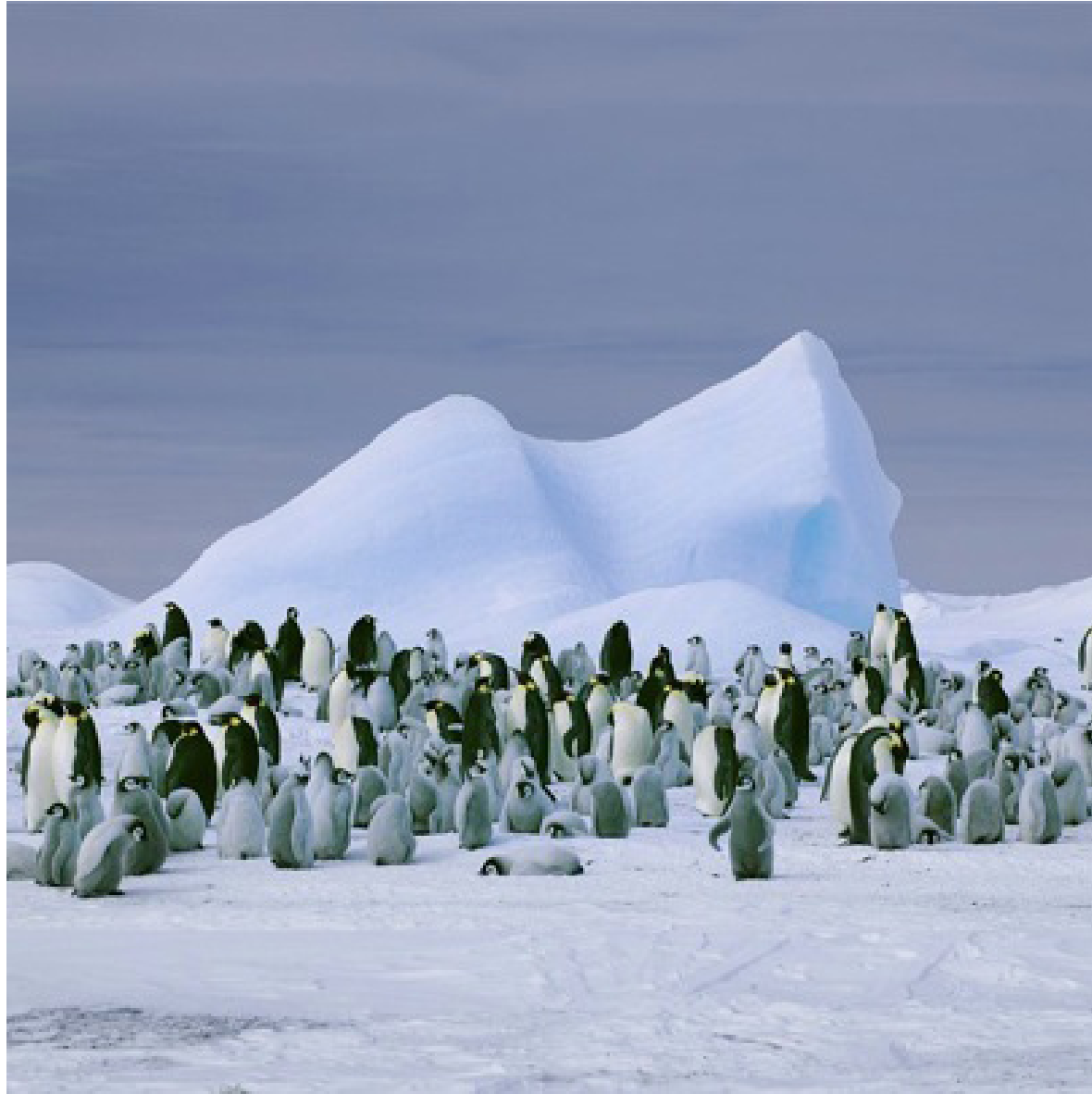
David Burdeny, Penguins Snow Hill Island archival pigment print, 24 x 24 inches