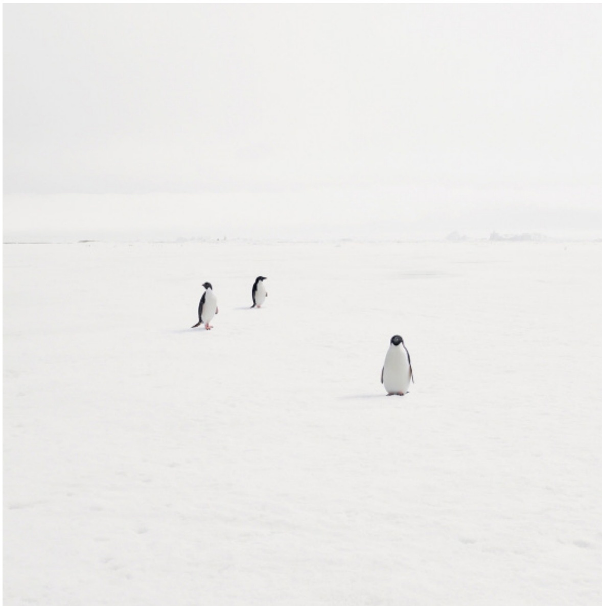
David Burdeny, Three Adeli Penguins on Fast Ice archival pigment print, edition of 7, 23 x 23 inches