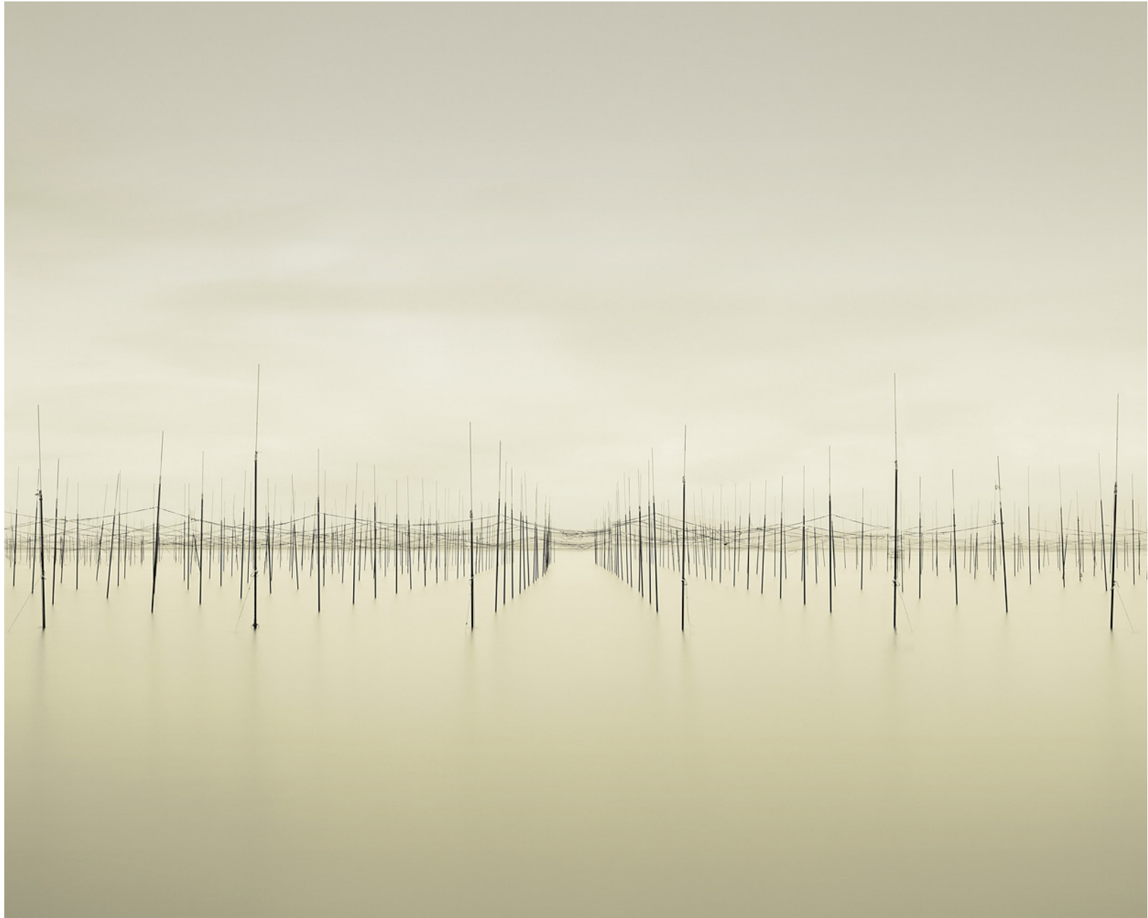
David Burdeny, Matrix Ariake Sea , 2010 archival pigment print, edition of 7 +2AP, 44 x 55 inches